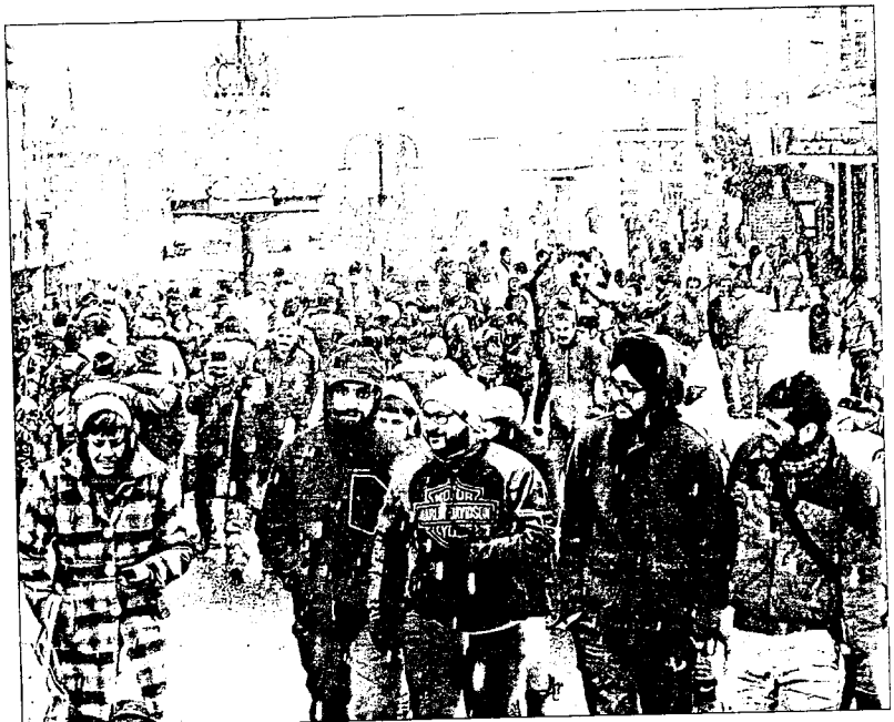
हिमाचल प्रदेश के शिमला में मंगलवार को हो रही हल्की बर्फबारी का लुत्फ उठाते पर्यटक।