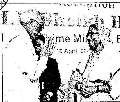
Bangladesh PM Sheikh Hasina with senior BJP leader L K Advani during a reception in New Delhi on Monday.

The Bangladesh PM, however, noted that the West Bengal Chief Minister had offered her electricity. "Paani mangaa to electricity mila. Lekin electricity milaa achha hai kuch toh mila naa (we asked for water, she gave us power, but at least we got something)", Hasina said, in a departure from her prepared speech.