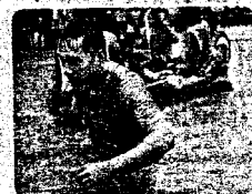
Rescuers in action after a typhoon in the Philippines in 2014

12-15% more violent typhoons in the last 37 years