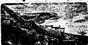
A seawall to keep waters out in Indonesian capital Jakarta, one of the fastest-sinking cities in the world

+3.3mm per year Rise 25 to 30% faster from 2004 to 2015 than 1993 to 2004