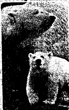
Polar bears are among the several species threatened by rising temperatures

19% of the 8,688 threatened species are threatened by climate change