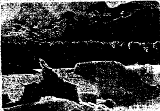
Melting glacial ice from Argentina's Southern Patagonian Ice Field in Nov 2015