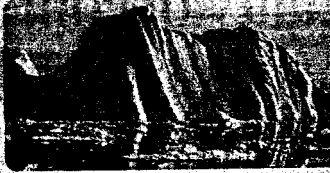
An iceberg broken off from a glacier floats near south-west Greenland

2nd smallest summer ice pack extent ever in 2016 (4.14m sqkm)