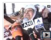
Man installs CCTV to expose wife