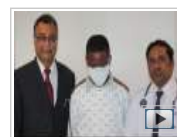
HIV no bar for kidney transplant

Subscribe - Deccan Herald's YouTube channel