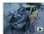
Dozens killed in Islamic State attacks in...