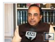
BJP, PDP to mutually decide next J-K...