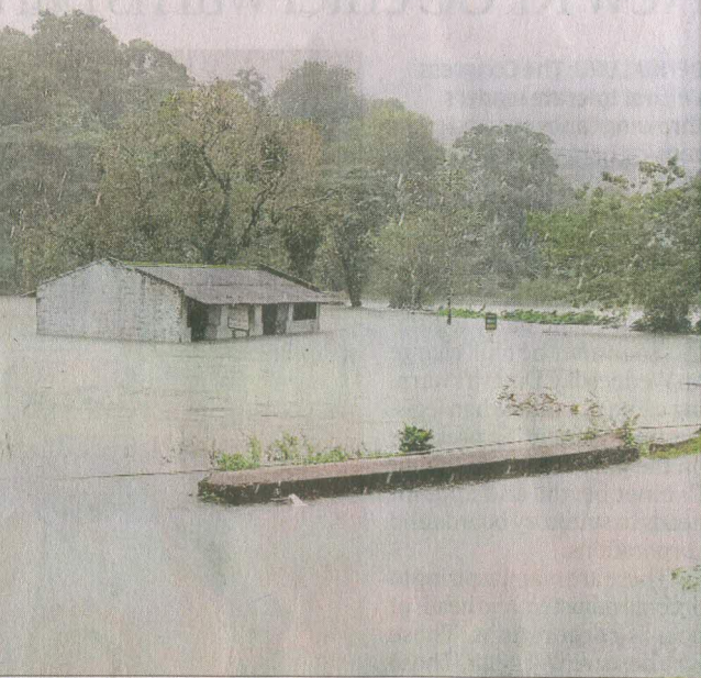
dated on Wednesday following heavy rain.

luk as they can intensify sowing activities.