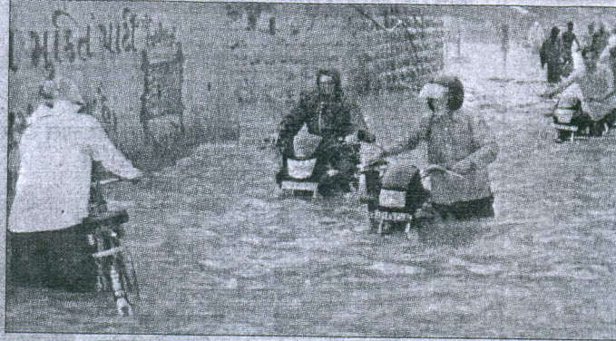
सूरत में भारी बारिश के बीच बंद हुए वाहनों को लेकर पानी से गुजरते वाहन चालक।

अहमदाबाद (भाषा): गुजरात के नवसारी और वलसाड जिलों के कई रिहायशी और निचले इलाके में भारी बारिश की वजह से आज पानी भर गया और लोगों को परेशानी का सामना करना पड़ा। सूरत शहर के कई हिस्सों में भी जलभराव हुआ है। राज्य आपात स्थिति नियंत्रण कक्ष के मुताबिक, सौराष्ट्र क्षेत्र के कई इलाकों में आज भारी बरसात हुई है। दक्षिण गुजरात खासतौर पर वलसाड और नवसारी जिलों में सुबह से ही मूसलाधार बारिश हो रही है, जिस कारण सड़कों पर पानी भर गया है और नदियां उफान पर चल रही हैं। इसने जन जीवन को प्रभावित किया है। मध्य और दक्षिण गुजरात में बुधवार से ही बारिश हो रही है। राज्य के विभिन्न इलाकों, खासतौर पर मध्य गुजरात के इलाकों से कल से करीब 900 लोगों को सुरक्षित स्थान पर पहुंचा है। सौराष्ट्र के गिर सोमनाथ जिले के उना और कोडिनार ताल्लुका में भारी बारिश रिकॉर्ड की गई है। सरकार की ओर से जारी किए गए आंकड़ों के मुताबिक, डांग जिले की वाघई ताल्लुका में सुबह आठ बजे से दोपहर दो बजे के बीच सबसे ज्यादा 103 मिमी बारिश रिकॉर्ड की गई है।