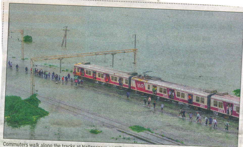
Commuters walk along the tracks at Nallasopara as WR services in the Vasai-Virar belt resumed on Wednesday but crawled due to speed restrictions as the water level stayed 160-170mm over the tracks