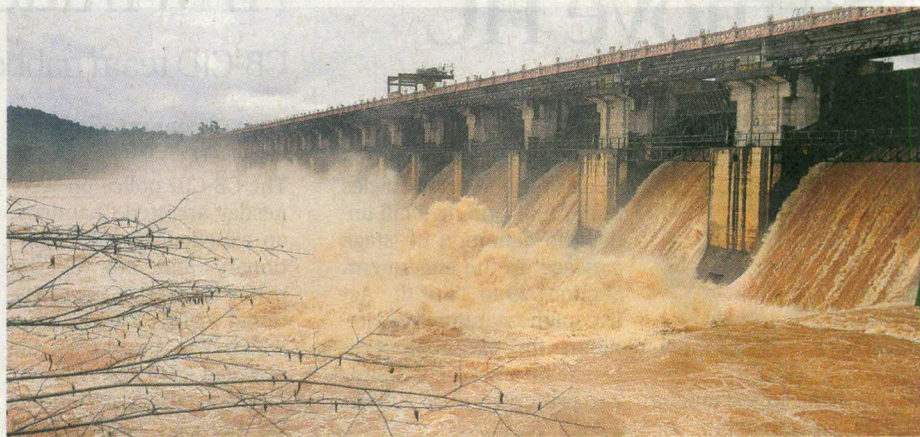
In full flow: Twenty crest gates were opened at the Gajanur Tunga Reservoir near Shivamogga on Wednesday due to heavy rain in catchment areas.

"The cumulative inflow into the reservoir since June 1 is 42.337 tmcft against which 29.61 tmcft has been discharged so far," according to