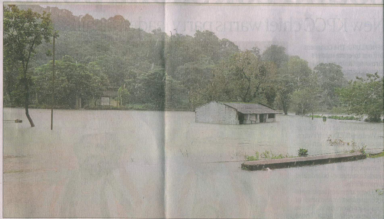
The bathing ghat at Bhagamandala in Kodagu district is inundated on Wednesday following heavy rain.

With heavy rain in Wayanad and surrounding areas, in both