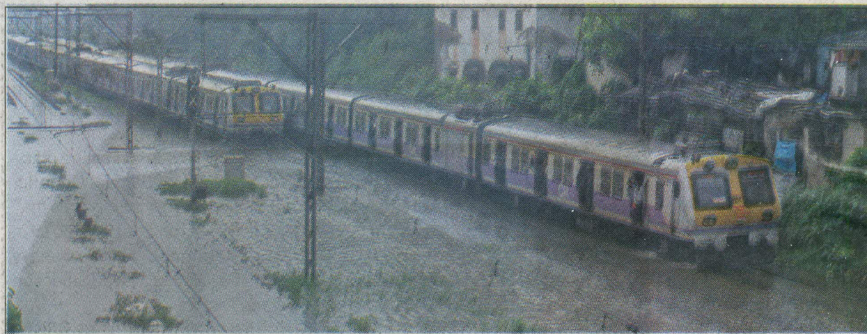
Local trains stuck on the flooded railway tracks in Mumbai on Tuesday.