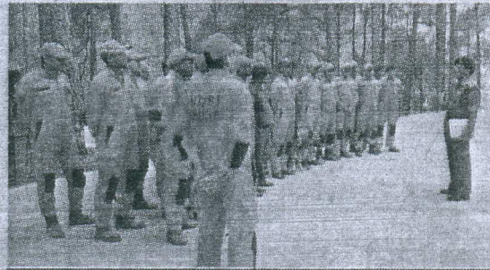
नई दिल्ली में देश के संभावित आपदा प्रभावित 71 स्थानों पर मोर्चा संभालने के लिए तैयार एनडीआरएफ के जांबाज।

नई दिल्ली, (भाषा): आपदा मोचन बल (एनडीआरएफ) के करीब 4500 कर्मियों वाली लगभग 100 टीमों को देशभर में 71 स्थानों पर बाढ़ एवं भारी वर्षा से निपटने के लिए तैनात किया गया है। एनडीआरएफ की सभी बटालियनों में अतिरिक्त टीमों को तैयार स्थिति में रखा गया है और उन्हें मांग के अनुरूप भेजा जाएगा। गृह मंत्रालय के एक अधिकारी ने कहा कि एनडीआरएफ ने देशभर में कम से कम 14 राज्यों में 71 स्थानों पर बाढ़ प्रभावित लोगों के बचाव एवं उन्हें राहत मुहैया कराने के लिए 97 टीमों तैनात की हैं। एनडीआरएफ की एक टीम में 45 कर्मी होते हैं। बल भारतीय मौसम विभाग, केंद्रीय जल आयोग और अन्य एजेंसियों के साथ लगातार सम्पर्क में है। बटालियन कमांडर संकट के समय सभी संभव मदद मुहैया