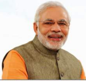
Shri Narendra Modi, Hon'ble Prime Minister of India