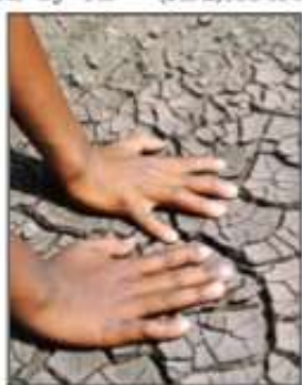
The maximum grant of Rs 1,737 crore will be given to Tamil Nadu

This is the second consecutive year when the country faced drought situation. Though the Kharif sown area this year was higher than last year, deficit rainfall will affect the overall output. The situation may further lead to farm distress if the states cannot cope with the deficit during the ongoing Rabi sowing season.