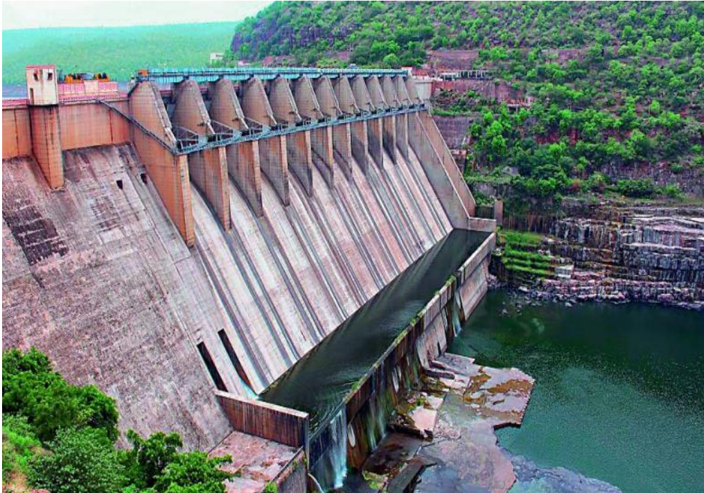
File picture of the Srisaillam project.

Hyderabad: The Srisaillam Left Bank Canal tunnel project has imposed a “dollar burden” on the Telangana state government.