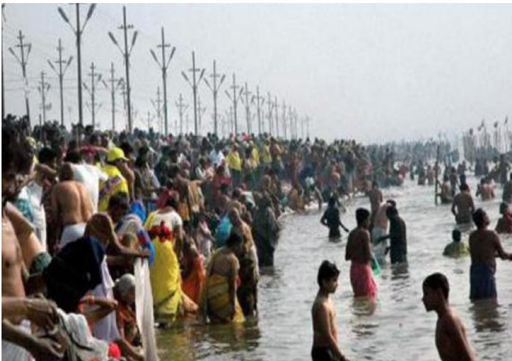
File photo of River ganges.

pronouncement has predictably upset Ms Bharati.