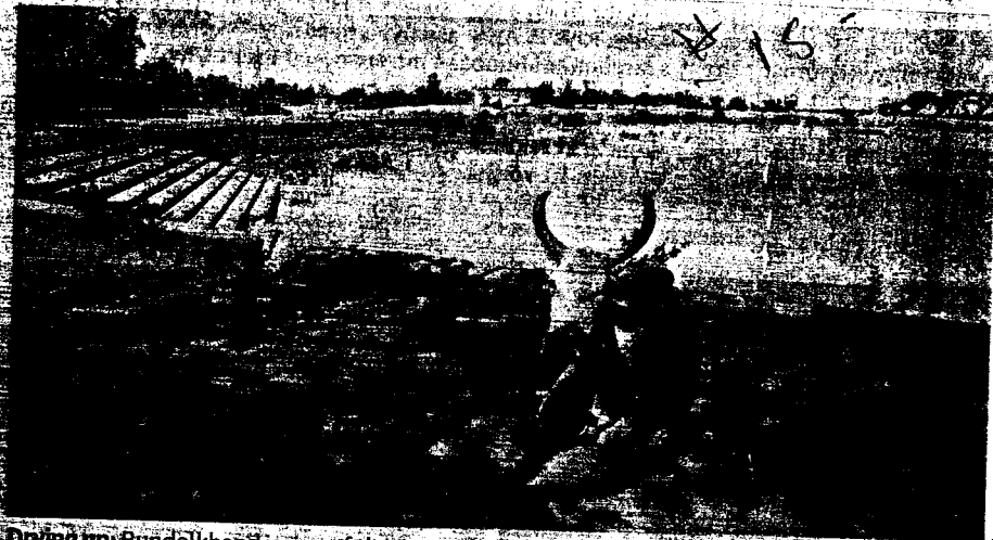
Drying up: Bundelkhand is one of the areas in Uttar Pradesh affected by recurrent drought, causing misery to livestock.

A government spokesperson said officials had been instructed to publicise ways of preserving moisture in the