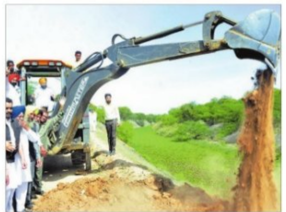
Akali workers fill the SYL canal at a village on the Chandigarh road near Banur on Wednesday.