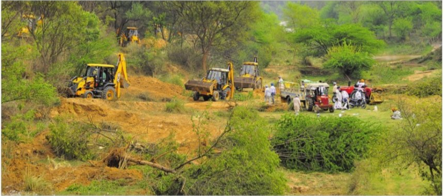
Trees uprooted by JCB machines deployed to fill up the SYL canal with earth near Chunni village of Bassi Pathana block in Fatehgarh Sahib district.

CHANDIGARH | NEW DELHI | JALANDHAR | BATHINDA | SRINAGAR | WWW.TRIBUNEINDIA.COM | VOL. 136 NO. 76 | 3