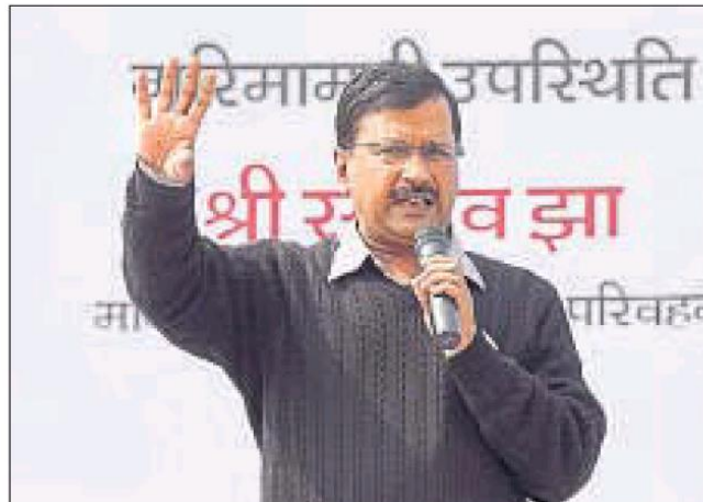
■ Aam Aadmi Party national convener and Delhi chief minister Arvind Kejriwal at a rally in Delhi.

Leader of the opposition Abhay Chautala, who was not present during the motion, addressed newsmen later