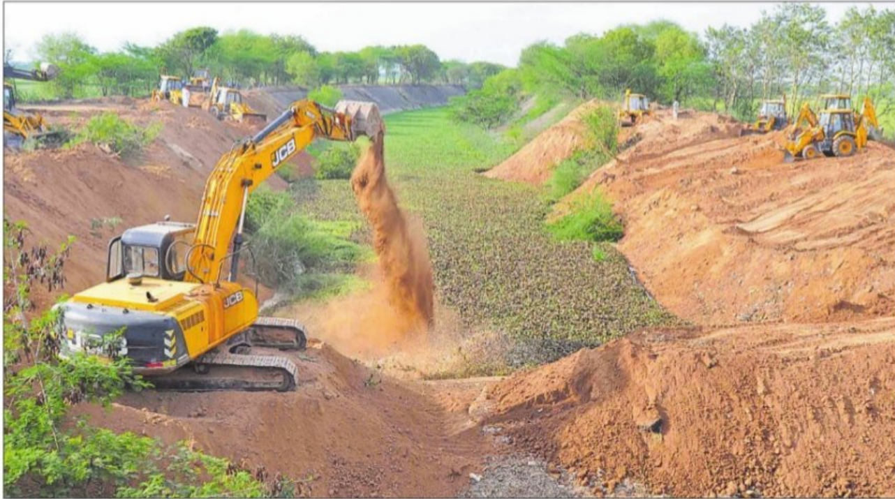
JCB machines level the SYL canal at a village near Banur on Wednesday; and (below) a farmer oversees canal demolition work at Doomchheri village in Ropar district.