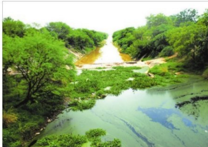
Water sharing disputes can't be resolved by courts or tribunals.

Similar river water disputes had persisted between Karnataka and Tamil Nadu over the Kaveri waters since 1892; between Andhra and Telengana now and with other neighbouring states over the Krishna and Godavari waters since the reorganisation of states post 1956 and so on. The difference between them and Punjab's case is that Rajasthan was never a riparian state in respect of the Ravi, Beas or Sutlej, and Haryana's