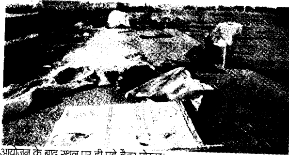
आयोजन के बाद स्थल पर ही पड़े बैनर-पोस्टर।

श्रीश्री रविशंकर की संस्था आर्ट ऑफ लिविंग के विश्व सांस्कृतिक महोत्सव के खत्म होने के बाद भी नए पेंच सामने आ रहे हैं। यमुना तट पर महाआयोजन तो हो गया। अब यहां महागंध से लोग परेशान हैं। कारण है आयोजन स्थल पर पसरा कचरा व गंदगी। इस तीन दिवसीय आयोजन में दुनिया भर के तमाम देशों से दो लाख से ज्यादा लोगों ने शिरकत की, लेकिन इसके समापन के बाद दिल्ली-नोएडा डायरेक्ट फ्लाईवे के प्रवेश द्वार से अंदर जाते ही वहां बने 15 अस्थायी शौचालयों से जमकर बदबू आ रही है।