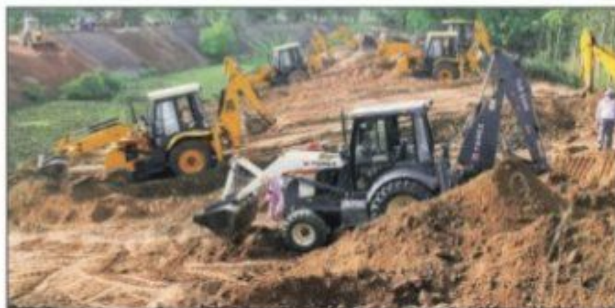
The canal being filled up near Patiala, Wednesday. Hameet Sodhi

At Bhateri village in Fatehgarh, local SAD leaders arrived with JCBs. The earthmovers began filling the canal, uprooting scores of trees in the process. The SAD workers sipped tea and supervised the operations. Impromptu langars came up. Tractor trolleys carried away the felled trees. A youth driving one of the trolleys