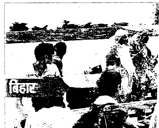
सीतामढ़ी में बेलसंड के मौलापुर गांव में बागमती का जलस्तर बढ़ने से न