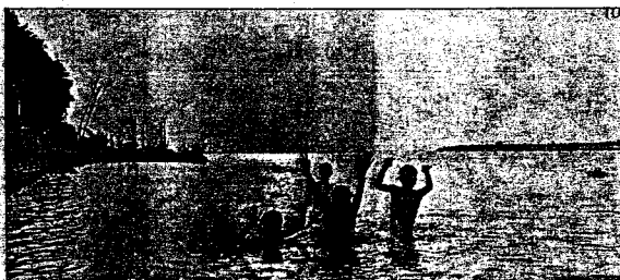
The NGT on Thursday prohibited dumping of waste within 500 metres from river Ganga

Mehta had filed the petition against four industries, including the public sector BHEL, and the rest is history. The SC had later clubbed cases pertaining to the Ganga river pollution. "Unfortunately, nothing was done on the ground. In fact, all the government agencies, local