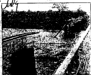
■ Damaged railway bridge over river Nagabali in Rayagada district on Sunday.

"We have requested four helicopters from Indian Air Force for dropping food packets in affected areas. Another Naval helicopter in Vishakhapatnam is in a state of readiness for rescue. With more rains expected in southern Odi-