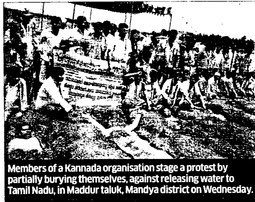
Members of a Kannada organisation stage a protest by partially burying themselves, against releasing water to Tamil Nadu, in Maddur taluk, Mandya district on Wednesday.