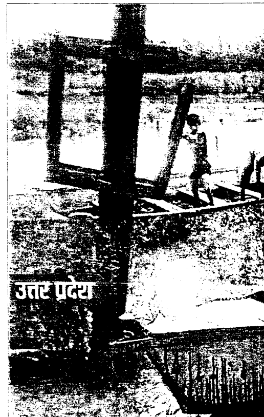
बिजनौर जिले के मंडावर क्षेत्र में शनिवार को गांव रावली में गंगा और माल