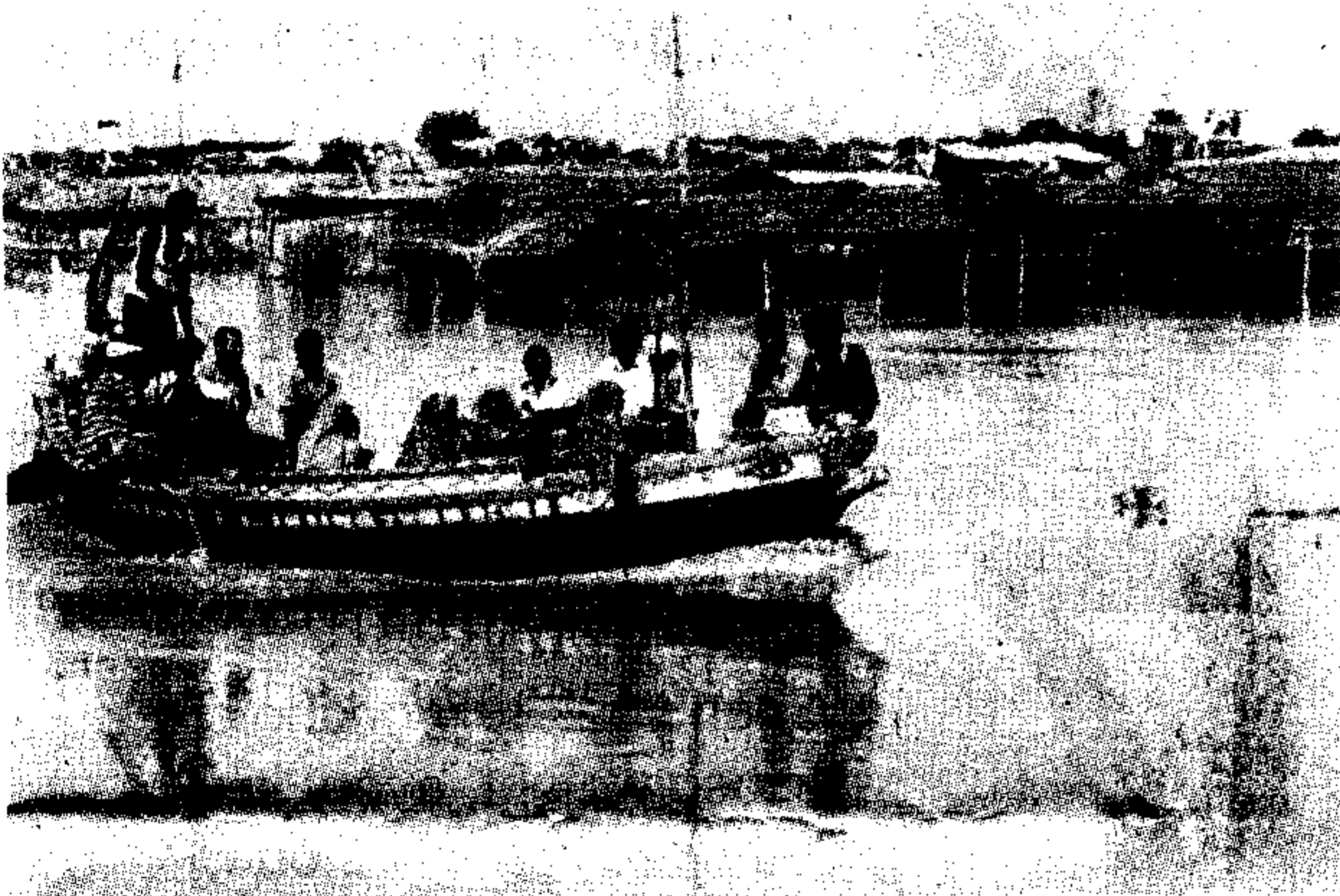
People moving to safety after their huts were submerged by the flood waters of the Ganga, in Patna on Sunday.

PATNA: The flood situation in Bihar has eased with no district remaining under water while the Ganga and five other rivers are flowing above the danger mark.