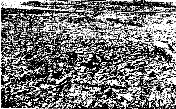
Going down: The Krishnaraja Sagar reservoir as seen on Monday.

For the first time in the year, the levels have dipped below the Minimum Draw-down Level (MDDL), which signifies the minimum water needed for power generation and irrigation of 74 feet. The reservoir had