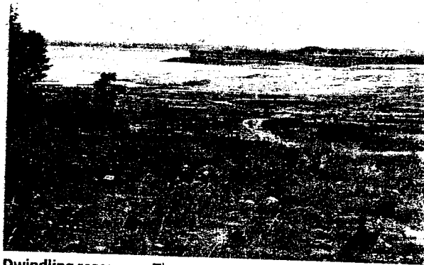
Dwindling resources: The water level has come down drastically in the Krishnaraja Sagar dam.

Water Resources Minister M.B. Patil, while addressing