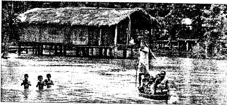
Living with floods: Provisions for boats and houses on stilts/platforms may be part of public awareness in flood-prone areas. An affected village at Dhakuakhana, on Saturday.