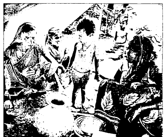
• A flood affected family takes shelter in a makeshift house at Goroimari village in Assam on Monday.