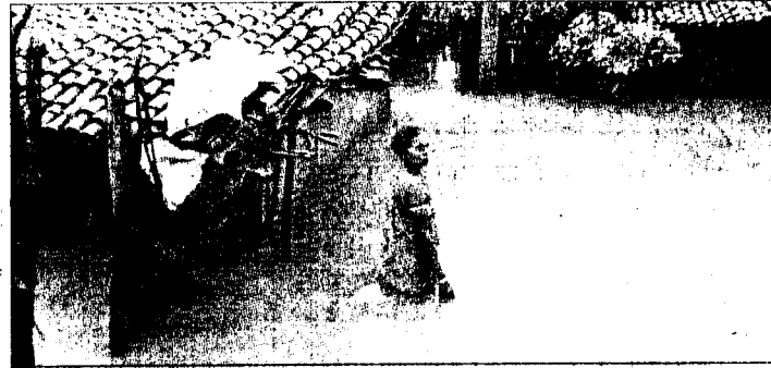
ओडिशा के रायगढ़ जिला के बाढ़ से घिरे गांव कल्याण सिंह पुर से बाहर निकलती महिला।

असम के 24 जिलों में लगभग 12 लाख लोग बाढ़ का प्रकोप झेल रहे हैं। पांच और लोगों के मरने से अब तक इस प्राकृतिक आपदा में मरने वालों की संख्या 65 हो चुकी है। आधा काजीरंगा राष्ट्रीय उद्यान डूबा हुआ है और 70 से अधिक जानवर मारे जा चुके हैं। दुर्लभ प्रजाति के एक सींग वाले गैंडे खतरे में हैं। प्रभावित जिलों में धोमाजी, बिस्वबाथ, लखीमपुर, सोनितपुर, दरांग, नलबाड़ी, बरपेटा, बंगाड़ांग, चिरांग, कोकराझार, धुबरी,