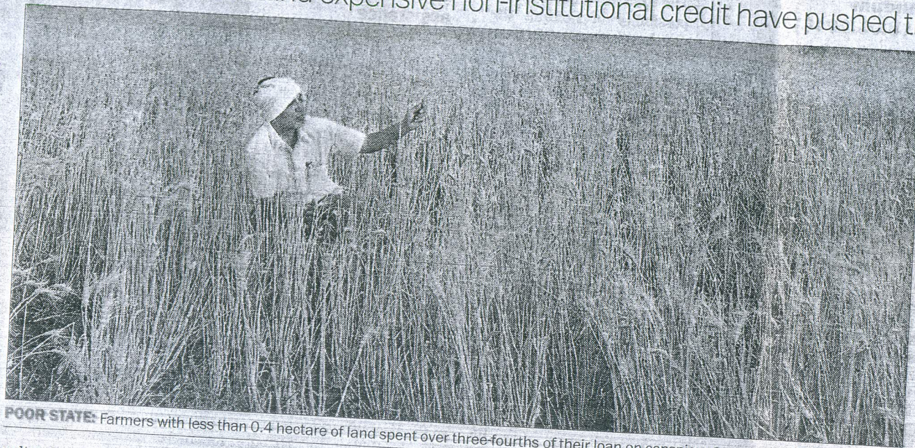
POOR STATE: Farmers with less than 0.4 hectare of land spent over three-fourths of their loan on conspicuous consumption.

Worse, farmers' suicides in Punjab seem to be on the rise. However, what misses the headlines is that over one-third of the suicides are by agricultural labourers. Reduced demand for farm labour, increased expenditure on medical and education needs and expensive non-institutional credit have pushed them into debt traps. They face a double-edged squeeze with greater use of labour-displacing agri-