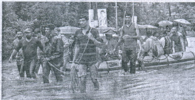
To a safer place: Police personnel and rescue team in action after heavy rain, in Kottayam on Tuesday. ■PTI

At many places, the water rose nearly five feet in living