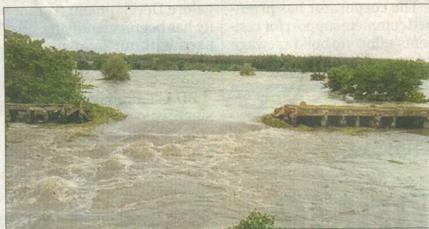
A portion of the 200-year-old Lushington Bridge across the Cauvery in Kollegal taluk of Chamara- janagar district that was washed away on Monday.

In Kerala, heavy rain left its central districts battered, as the southwest monsoon remained active and weather-