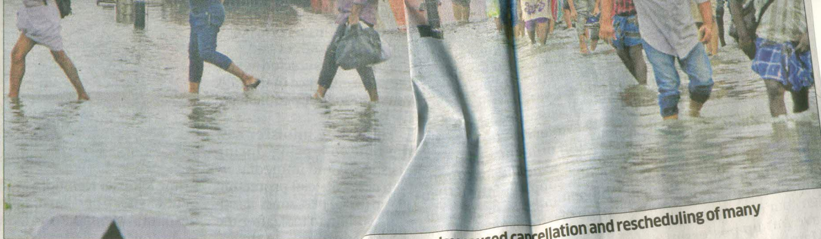
Flooding of tracks at the Ernakulam South railway station on Monday caused cancellation and rescheduling of many trains.

Kochi and Kozha, in Kottay- am, recorded extremely heavy rainfall of 23 cm each on Mon- day. Piravom in Ernakulam recorded 22 cm while heavy to heavy rainfall was recorded in Munnar and Peerumed in Idukki district (20 cm and 19 cm respectively).