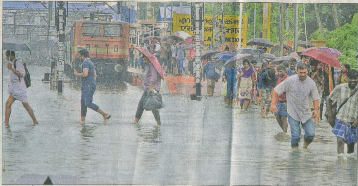
Flooding of tracks at the Ernakulam South railway station on Monday caused cancellation and rescheduling of many trains.

Kochi and Kozha, in Kottayam, recorded extremely heavy rainfall of 23 cm each on Monday. Piravom in Ernakulam recorded 22 cm while heavy to heavy rainfall was recorded in Munnar and Peerumed in Idukki district (20 cm and 19 cm respectively).