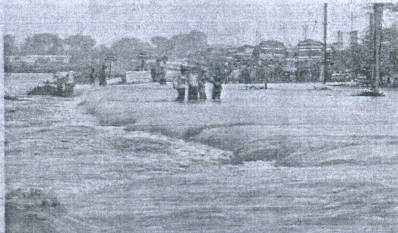
People wade through flood waters on the Una-Veraval highway in Una, Gir Somnath district on Tuesday.

More than 3,000 people were shifted and around