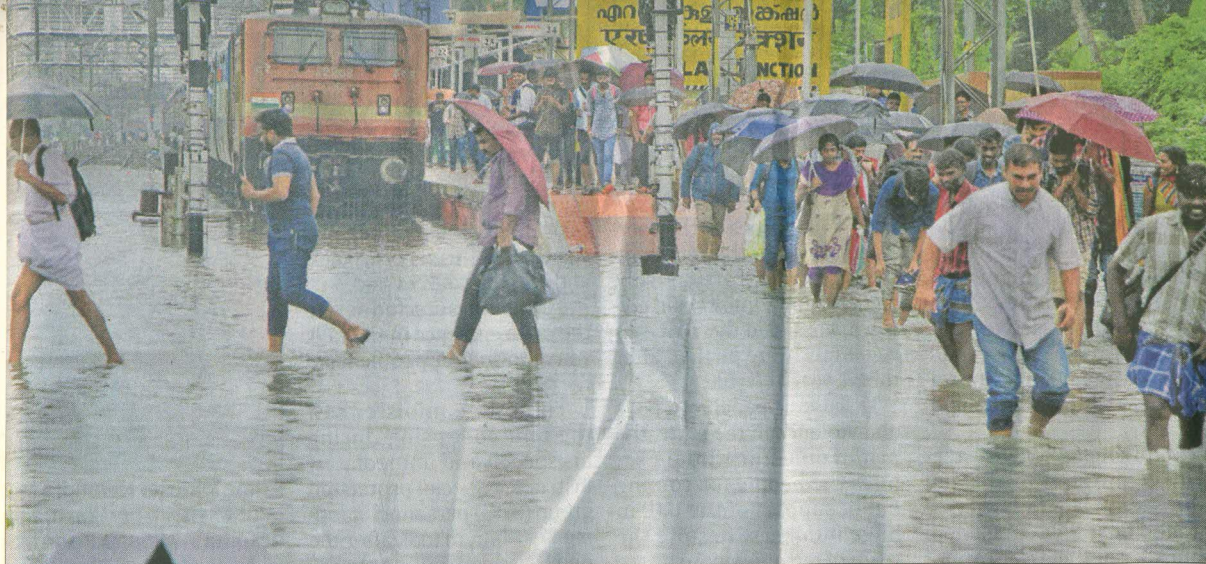
Flooding of tracks at the Ernakulam South railway station on Monday caused cancellation and rescheduling of many trains.

The state has recorded an overall loss of about Rs eight crore in rain-related damages over the past week, Revenue Minister E Chandrasekharan said after a review meeting here. The southwest monsoon set in over Kerala on May 29. Between June 1 and July 16, the state has recorded a cumulative rainfall 16% more than the long period average.