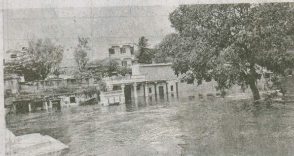
Fear of deluge: The flooded Paschima Vahini near Srirangapatna in Mandya district.

The rising water level in the Cauvery has already led