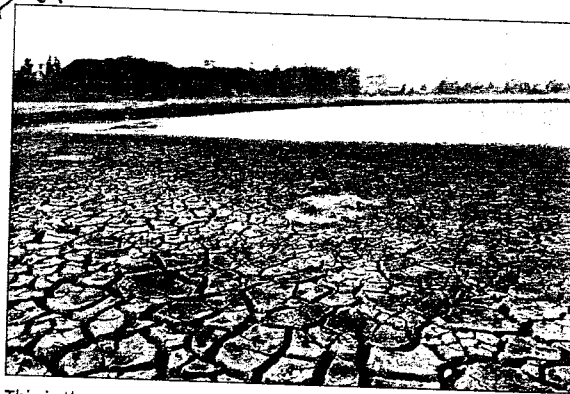
This is the second-highest deficiency recorded among the 61 river basins whose rainfall data is calculated by the IMD

The rain-deficit upper and middle Yamuna basins fall in the northwestern parts