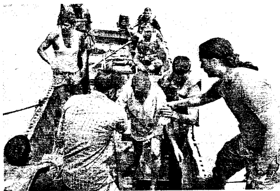
Help is at hand: Army personnel rescue flood victims in Katihar district of Bihar on Wednesday.