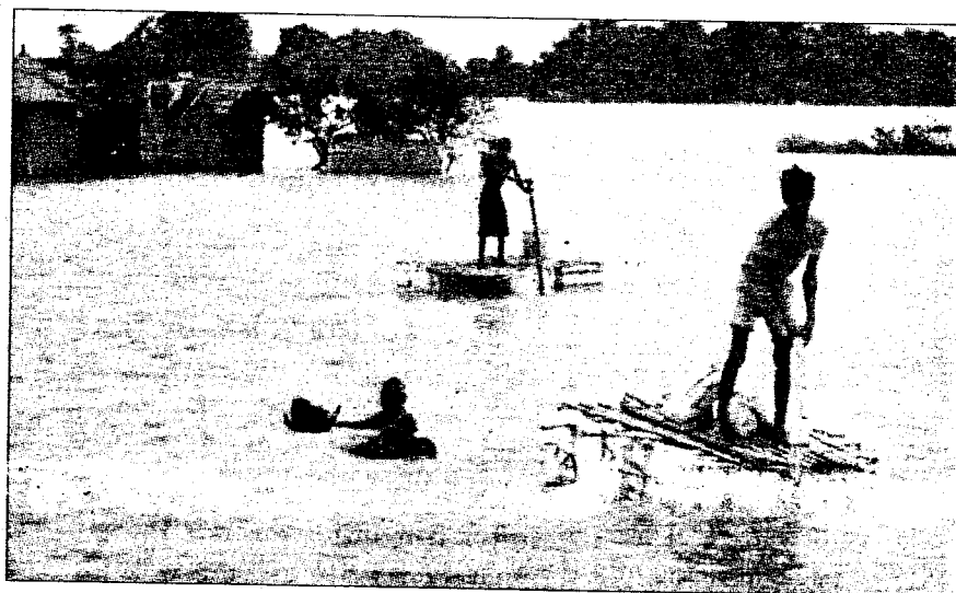
बाढ़ प्रभावित क्षेत्रों से अपने सामान के साथ पलायन करते लोग।

अभी भी अपना घर छोड़कर आने को तैयार नहीं हैं। पीड़ितों की सहायता के लिये ऊंचे और सुरक्षित स्थानों पर 504 राहत शिविर चलाये जा रहे हैं। विभिन्न राहत कैम्पों में एक लाख 70 हजार लोग शरण लिये हुए हैं। राहत शिविरों में मुफ्त भोजन की व्यवस्था की गयी है। कई प्रभावित इलाकों में समुदायिक रसोई घर भी बनाया गया है जहां लोगों को सुबह और शाम भोजन की व्यवस्था की गयी है। इसी तरह स्कूलों और कॉलेजों में भी अस्थायी कैम्प बनाया गया है जहां बड़ी संख्या में पीड़ित लोग शरण लिये हुए हैं। पशुओं के लिये अलग से कैम्प बनाया गया है जहां चारे की व्यवस्था की गयी है।