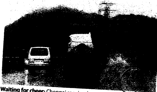
Waiting for cheer: Chennai received some rain over the past two days due to a low pressure area in the Bay.

A well-marked low pressure area lying over central and adjoining south Bay of Bengal is likely to intensify into a depression by Wednesday. This is expected to be the last weather system of the season, as the Southwest monsoon withdraws. Once it moves towards north