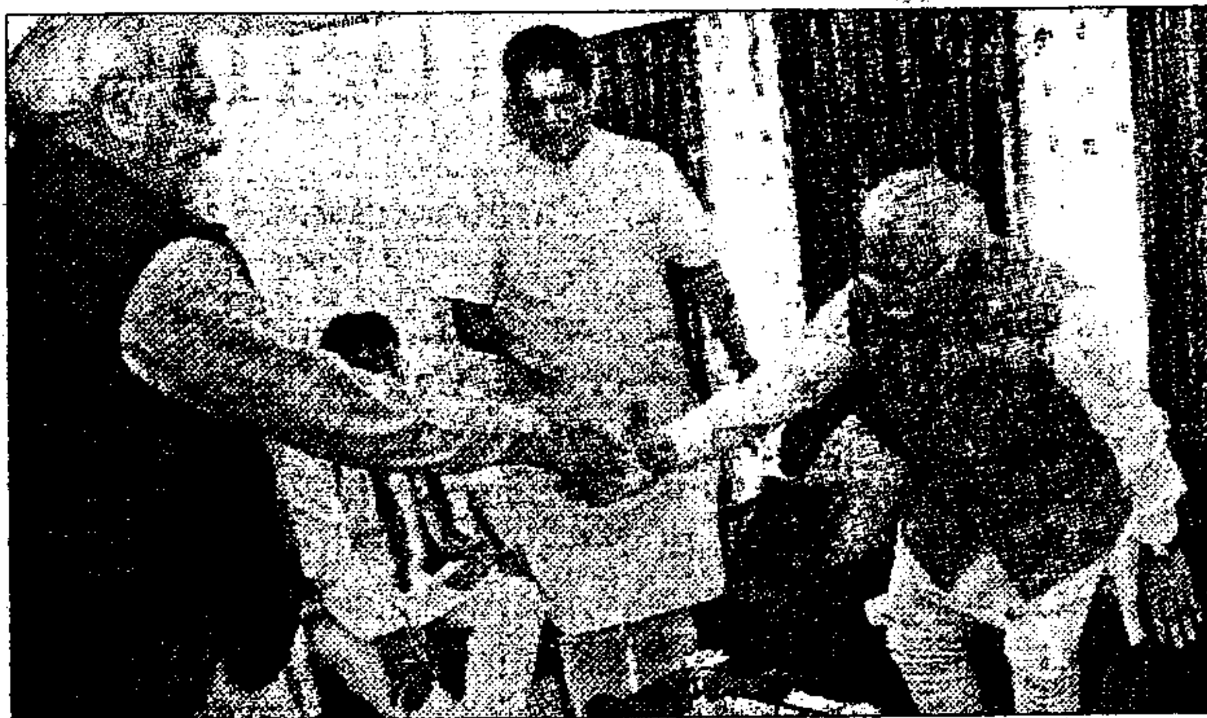
Haryana Chief Minister Manohar Lal Khattar welcomes former CM Bhupinder Singh Hooda on Thursday.