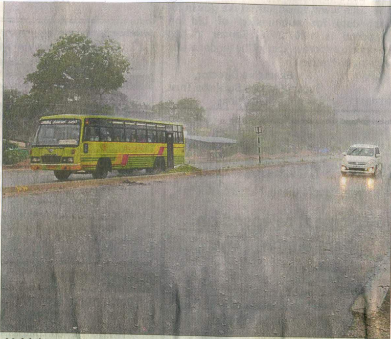
Vehicles use headlights in the noon due to poor visibility following rain in Karwar on Monday. (Right) Students return home amid heavy rain in Ballari.