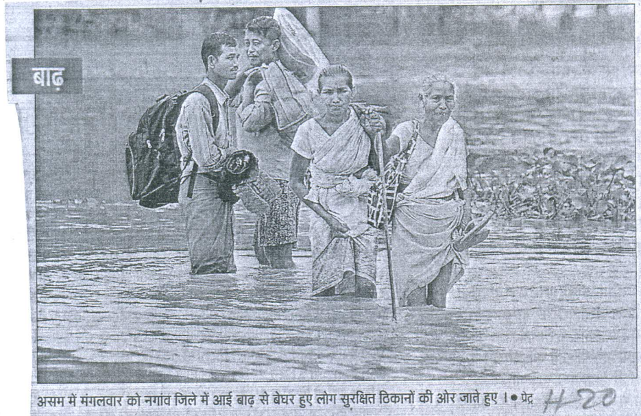
असम में मंगलवार को नगांव जिले में आई बाढ़ से बेघर हुए लोग सुरक्षित ठिकानों की ओर जाते हुए ।