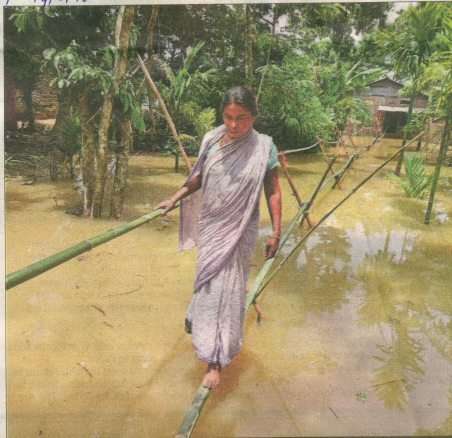
TREADING CAUTIOUSLY: A villager uses a makeshift bamboo bridge to cross a flooded area in Nagaon district, Assam, on Monday.

Till then, the heatwave in eastern and parts of central India will continue.