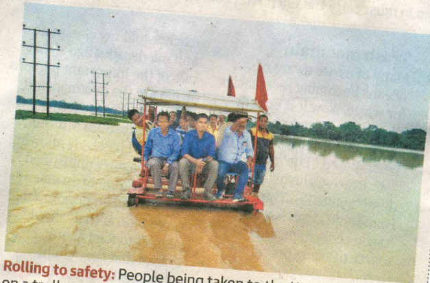
Rolling to safety: People being taken to the Katakhal station on a trolley on submerged tracks.

More than 400 others have taken shelter in nearby smaller stations such as