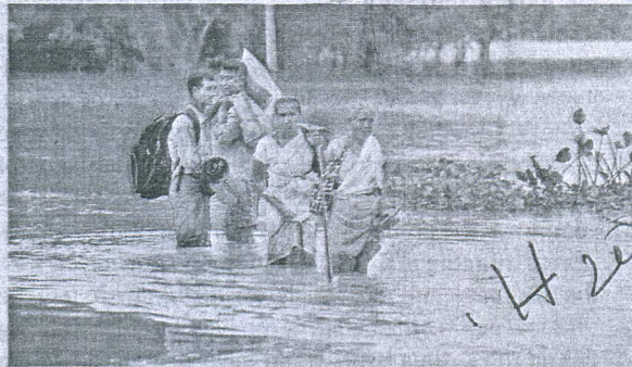
In deep waters: Villagers wade through floodwaters at Kampur in Nagaon on Tuesday.

and documented at Bhagirath(English)& Publicity Section, CWC.