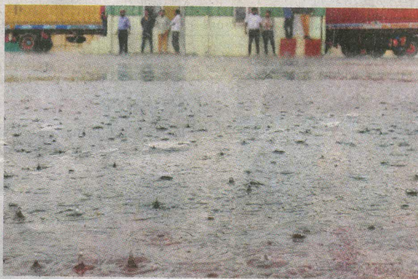
A low pressure over east the central Bay of Bengal may bring rain to the northern parts of the State. ■ B. JOTHI RAMALINGAM

While the city enjoyed overcast sky and light drizzle through the day, the weather