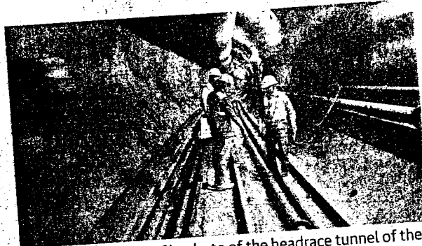
India's milestone: A file photo of the headrace tunnel of the Kishenganga hydel project at Bandipora.

Because of the Pakistani position, Kishenganga and