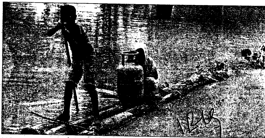
A boy rows a makeshift raft in Morigaon district of Assam on Friday.

Northeast Frontier Railway in Guwahati said it would take a few more days to restore movement of trains. Restoration work of Bridge No 3 between Kuretha and Maniyan stations in the Katihar-Malda section is expected to be completed by Friday night, the spokesman said.