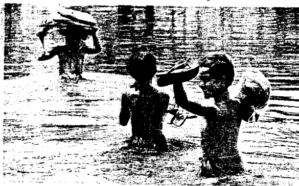
Water world: Bangladeshi schoolchildren waded through flood waters in Gaibandha district on Saturday.

Authorities have closed thousands of educational institutions in 18 districts in north and central Bangladesh, where most houses went under water and both road and rail communications were badly disrupted.