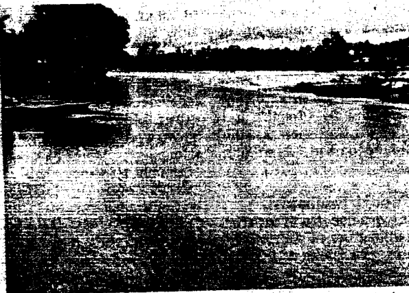
Water woes: A file picture of Cauvery river in spate in Mandya district of Karnataka.

Tamil Nadu submitted that the court should not leave the dispute open for Karnataka to take advantage of. Though the Centre argued that it is Parliament which has to finalise the scheme under the Inter-State Water Disputes Act of 1956,