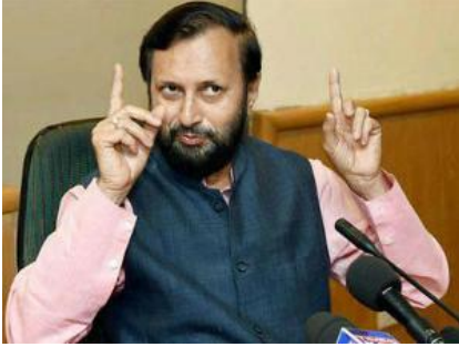
Environment minister Prakash Javadekar.

NEW DELHI: Days after the Chennai floods caught global attention during the just concluded Paris conference where world leaders linked such extreme weather conditions to climate change, the government on Monday said the unusual rainfall that occurred in Tamil Nadu was a "highly localised" event and its attribution to global warming is "not established".