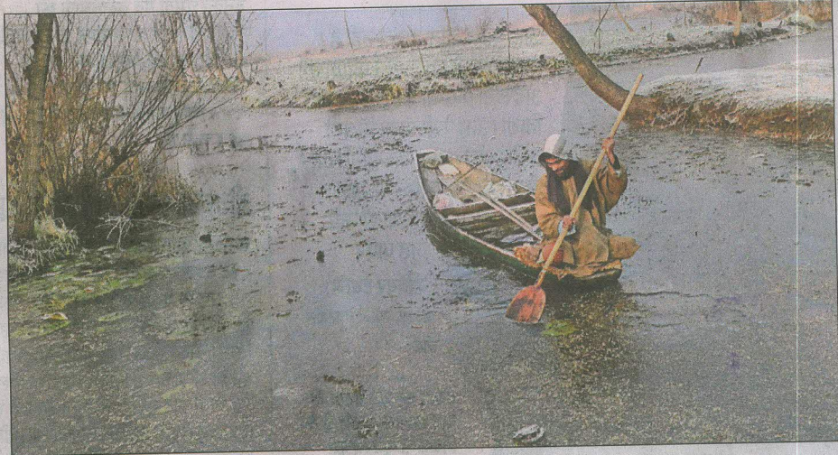
श्रीनगर में सोमवार को बर्फ से जमी निगिन झील।

बदलेगा हवाओं का रुख: विक्षोभ के कारण उत्तर भारत के मैदानी राज्यों में हवा का रुख भी बदलेगा। इस समय इन भागों में हवाएं उत्तर-पश्चिम दिशा से आ रही हैं। ये बदलकर दक्षिण-पूर्वी या दक्षिण-पश्चिमी हो जाएंगी। मौसम में आने वाले इस बदलाव और हवा की गति कम होने से दिल्ली समेत उत्तर भारत के मैदानी भागों में मध्यम से घना कोहरा छाने की संभावना है।