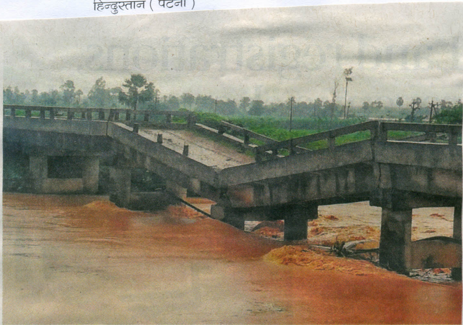
Falling apart: A bridge that was damaged due to floods at Tadavai village in West Godavari district on Monday.

The Deccan Herald ( Bengluru ) The Deccan Chronical ( Hyderabad ) Central Chronical ( Bhopal )