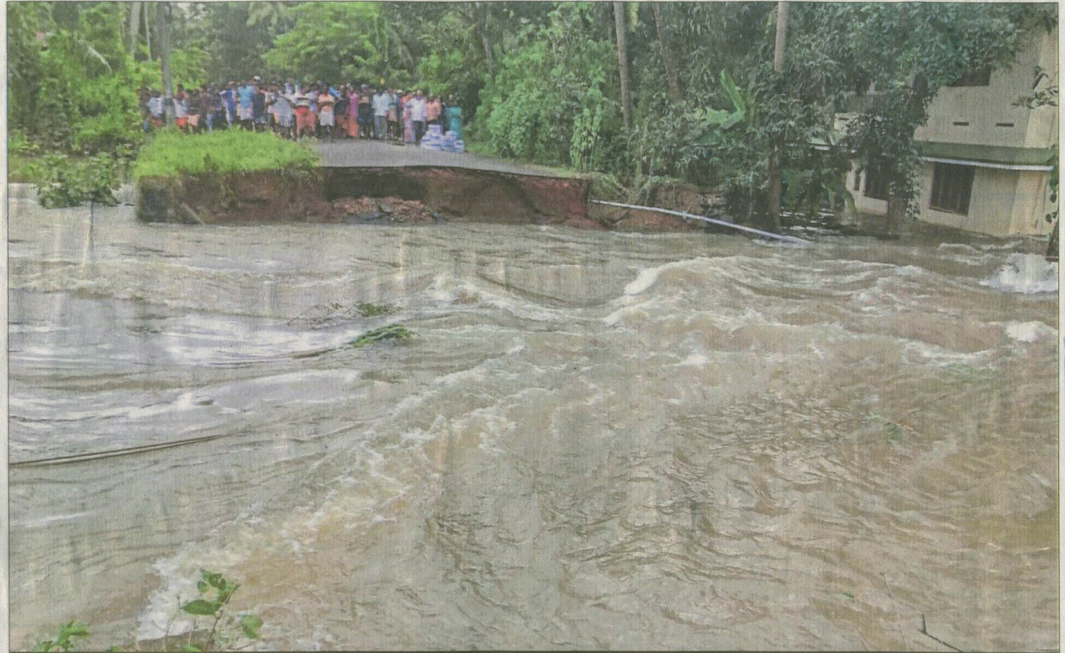
HOPE WASHED AWAY: People marooned after a road was damaged in a flood-hit Thrissur district of Kerala on Monday.

be dispatched to Kerala. "Although, there has not yet been reports about an outbreak of any disease in the flood-affected areas, a total of 12 medical teams have been put on standby," the official said.