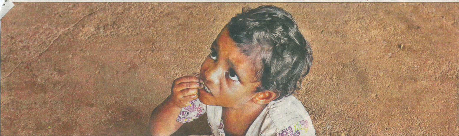
A child on Monday eats in a school that has been converted into a temporary flood-relief camp in Kochi, Kerala. ■ See Page 4 and Metro

The Deccan Herald ( Bengluru ) The Deccan Chronical ( Hyderabad ) Central Chronical ( Bhopal )