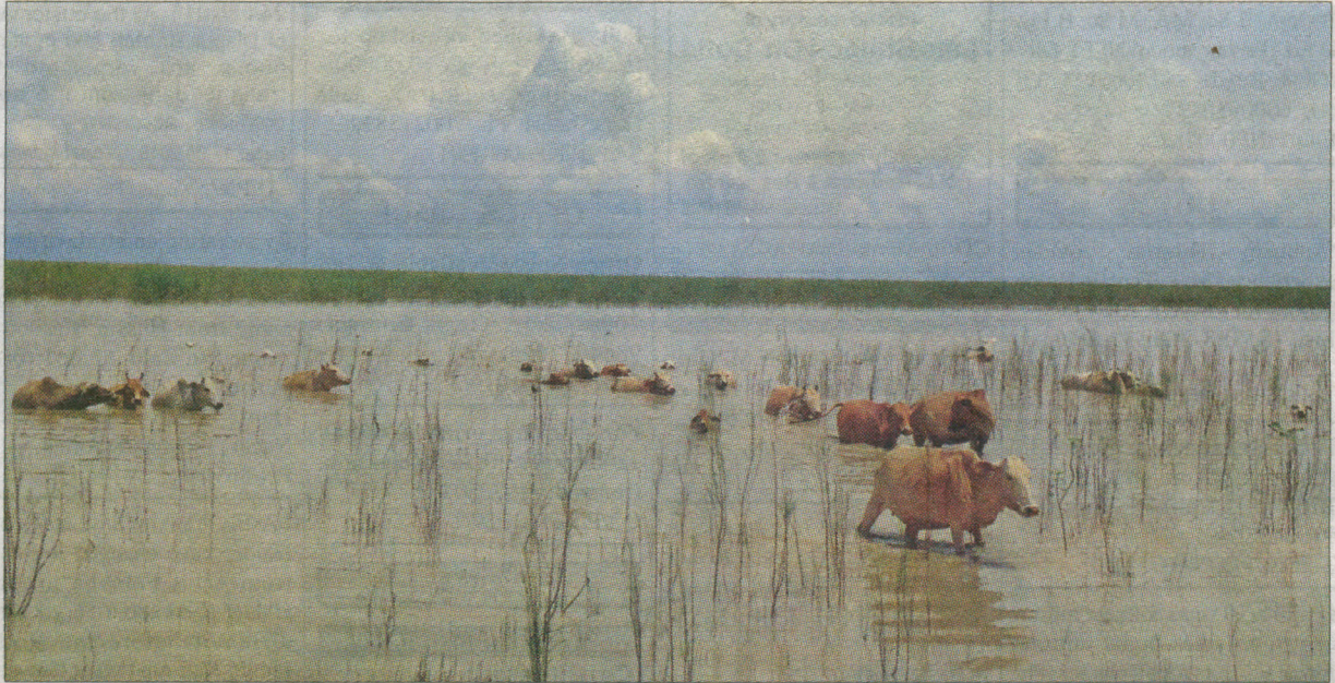
Cattle wading through a submerged paddy field on the river island Majuli, on Monday.

The Deccan Herald ( Bengaluru ) The Deccan Chronicle ( Hyderabad ) Central Chronicle ( Bhopal )