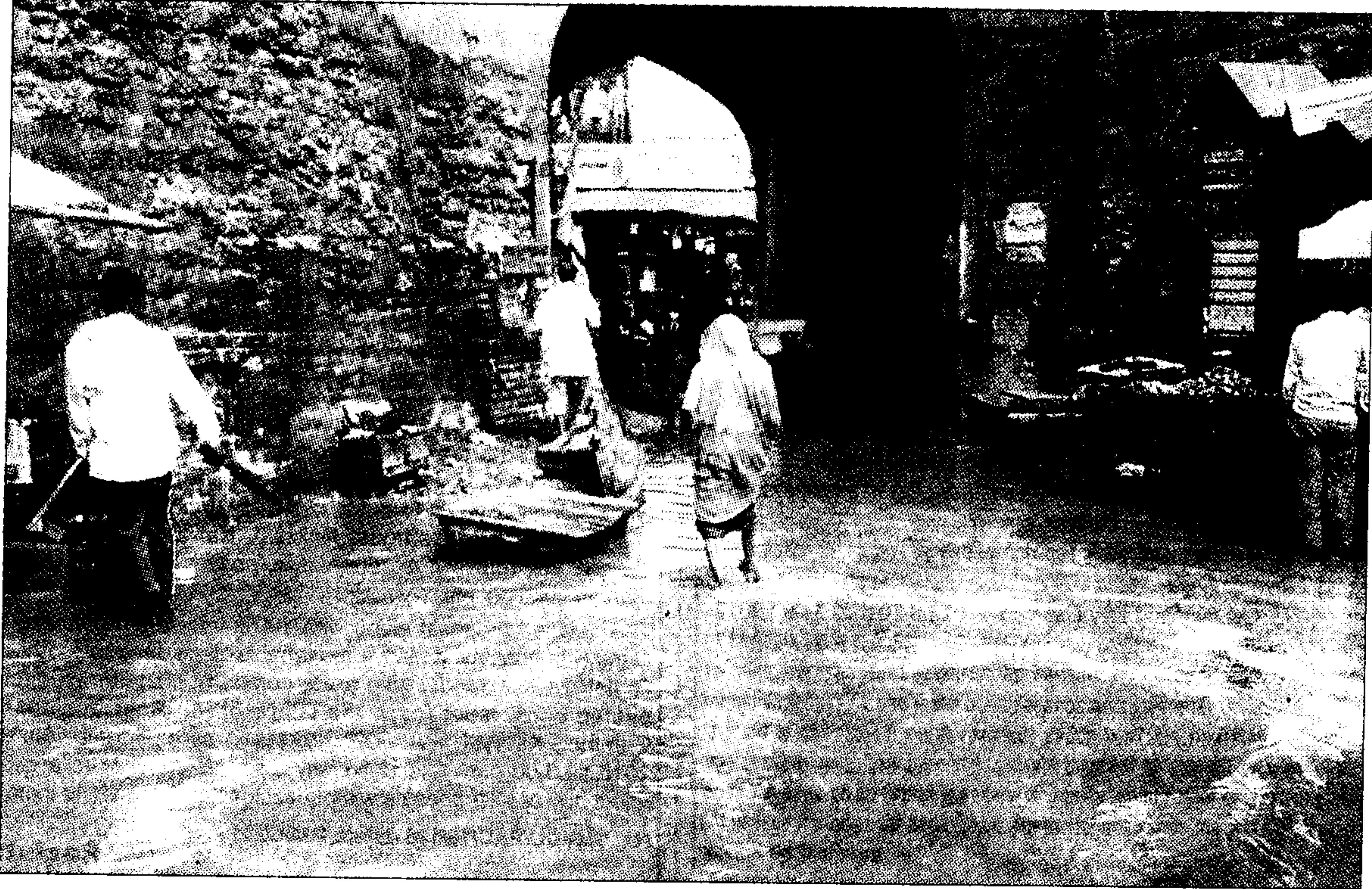
MONSOON WADING: Rain leaves Faruk Nagar in Gurgaon waterlogged on Thursday.