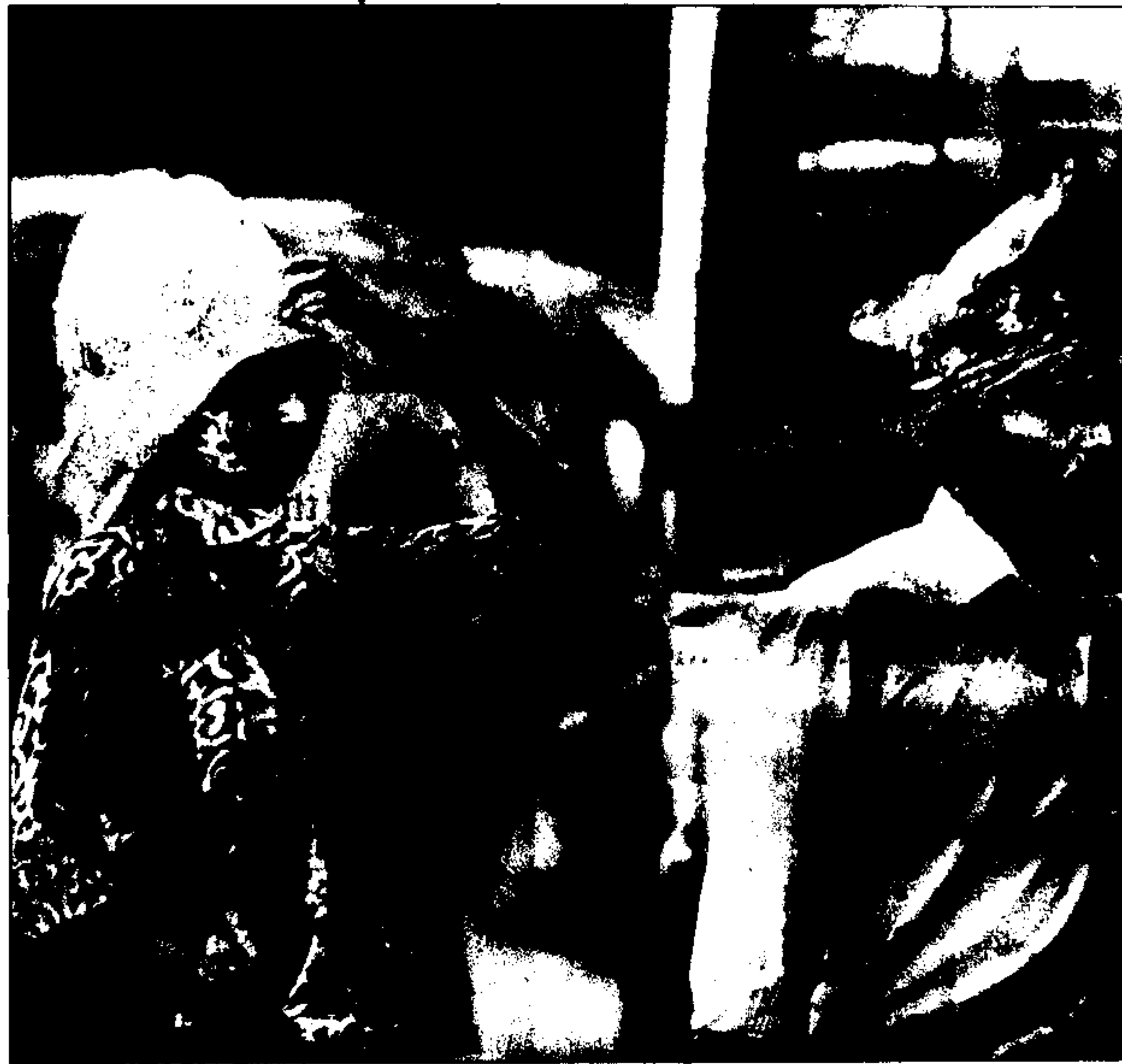
DISTRESSED BY DOWNPOUR Shoppers struggle to walk on the waterlogged Meenakshi Koil Street in Shivajinagar on Wednesday. Plastic covers come in handy for commuters at the Shivajinagar bus stand.