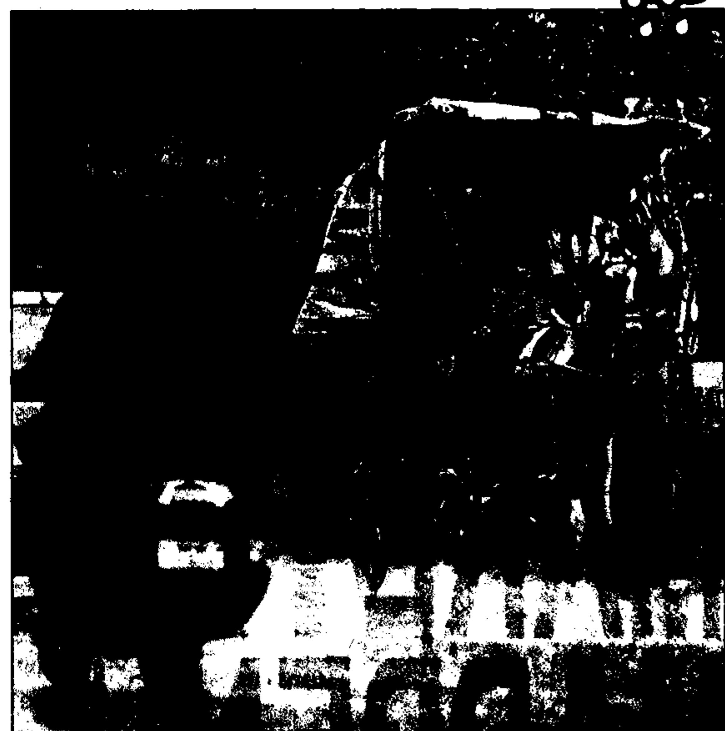
■ A cart ferries commuters as it rains in Allahabad on Thursday.