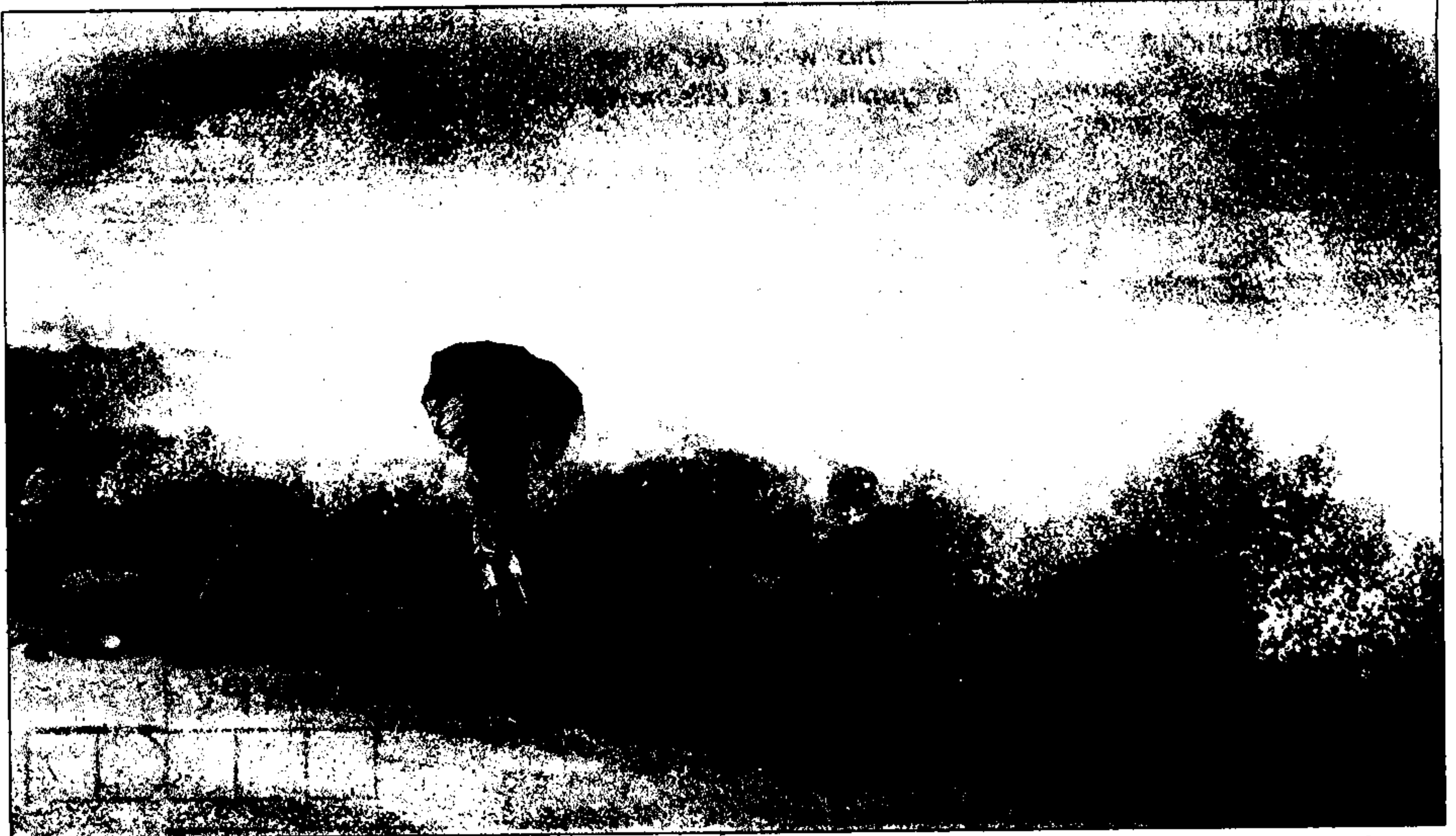
Though monsoon has just commenced in coastal region, sea erosion has already started in Ullal of Dakshina Kannada district. Huge waves have started to lash the shores. A view on Wednesday.

Though the southwest monsoon has been active in differ-