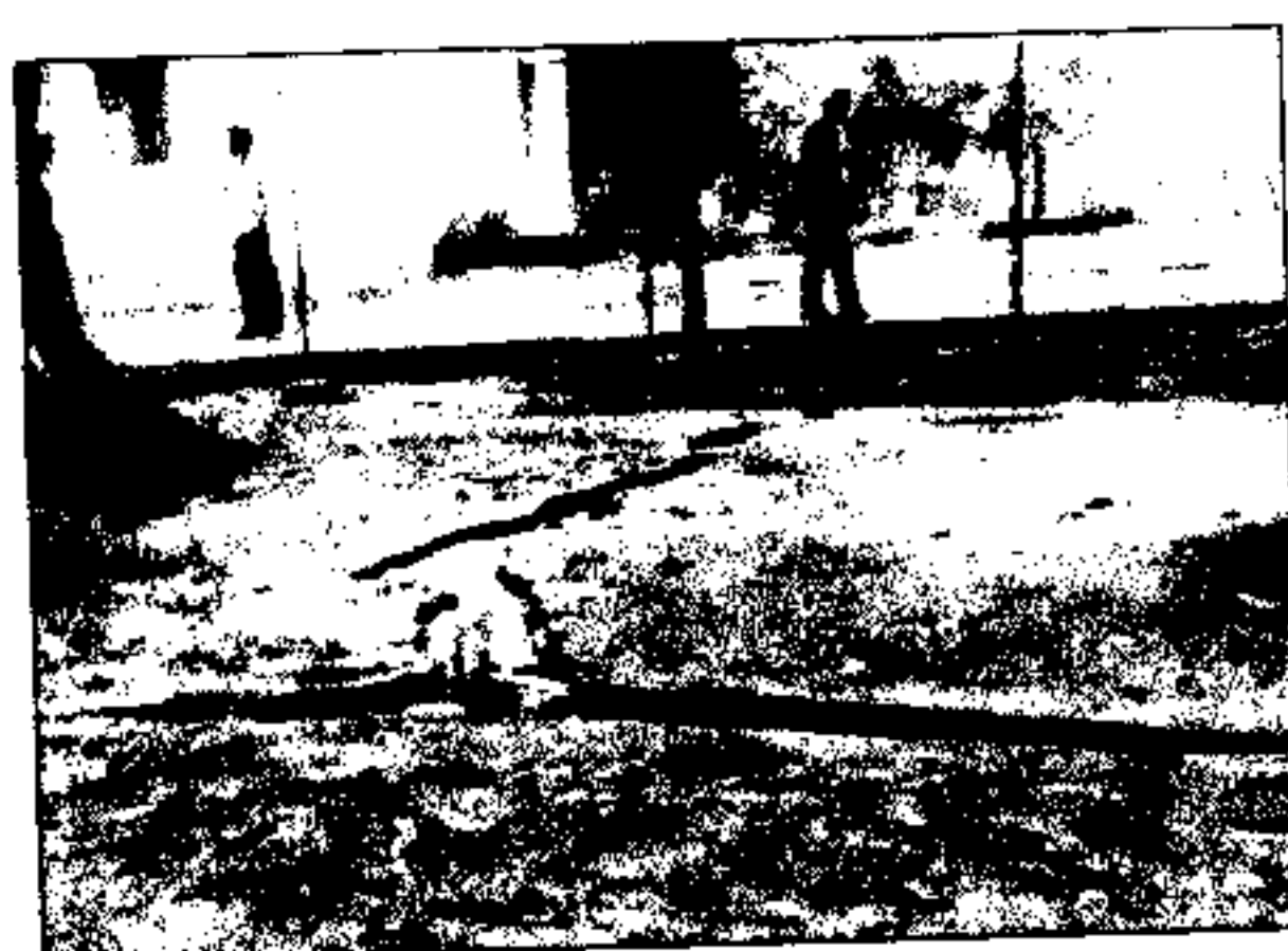
A view of cracks in a field where lightning struck during monsoon rains in Naubatpur in Patna on Tuesday.