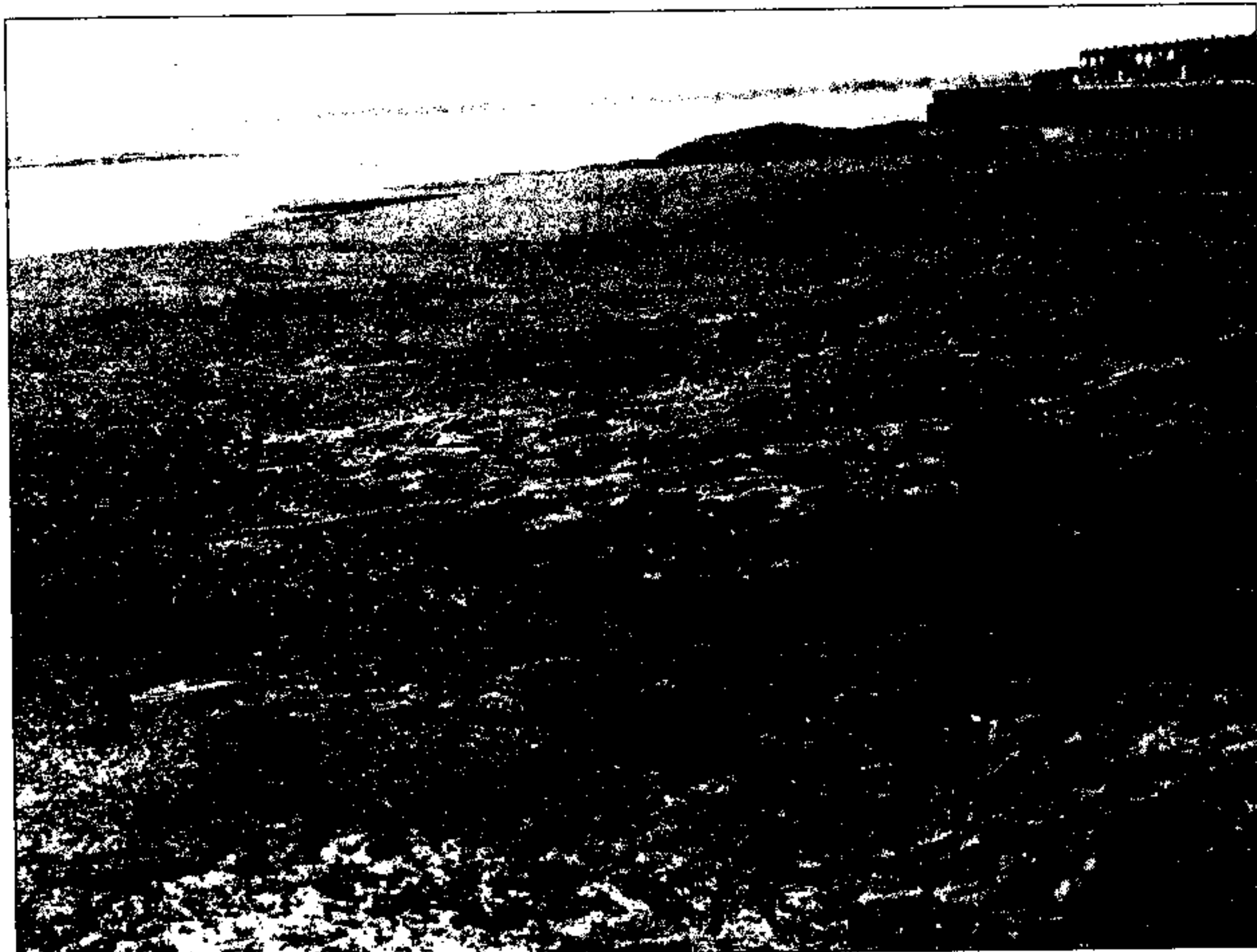
A view of the Krishnaraja Sagar reservoir in Srirangapatna taluk, Mandya district.

Mandya has been declared as a drought-hit district for three years. Even though the water level was low during those years, it had not plummeted to this year's low.