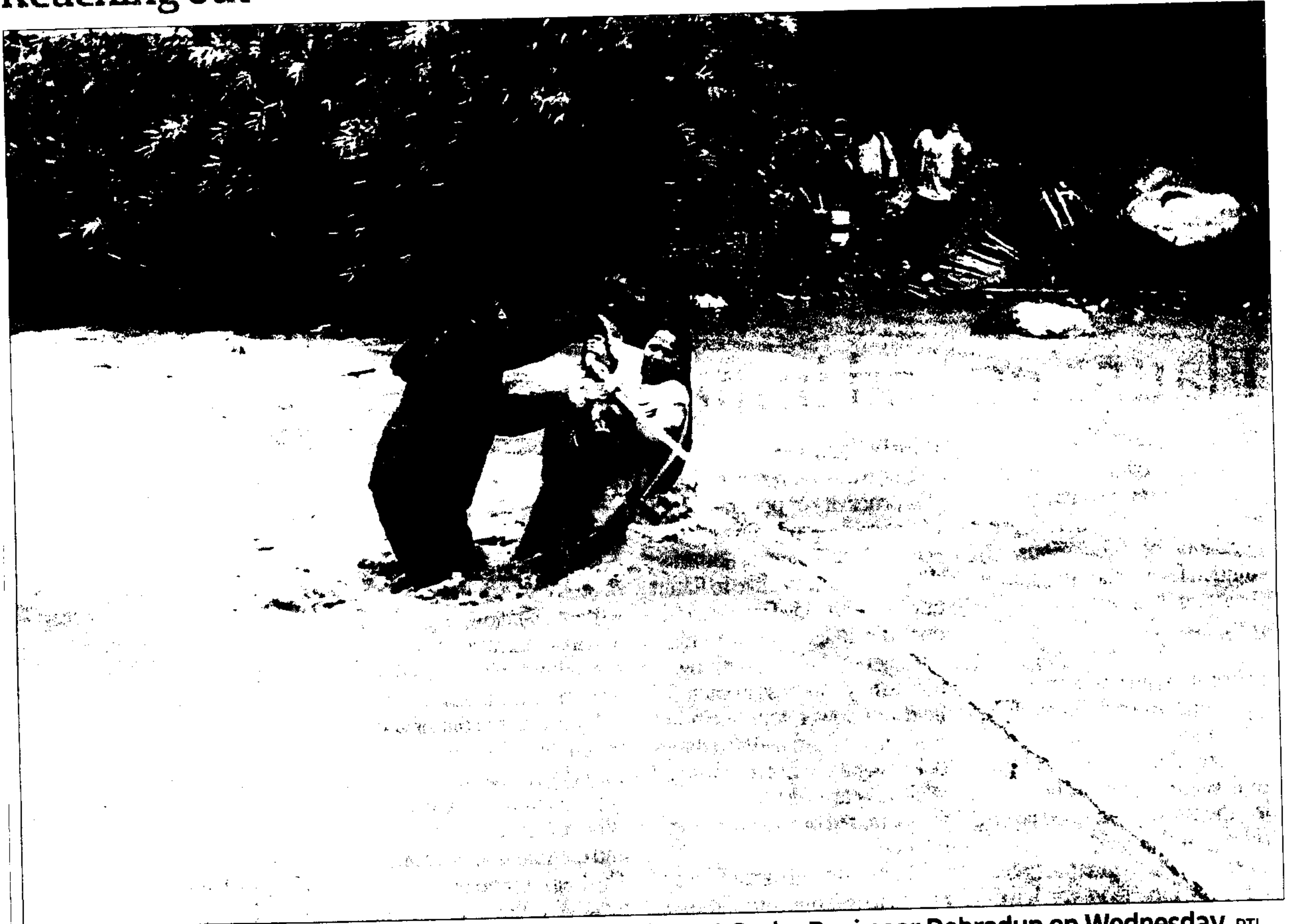
A policeman helps stranded people cross a swollen river at Guchu Pani near Dehradun on Wednesday.