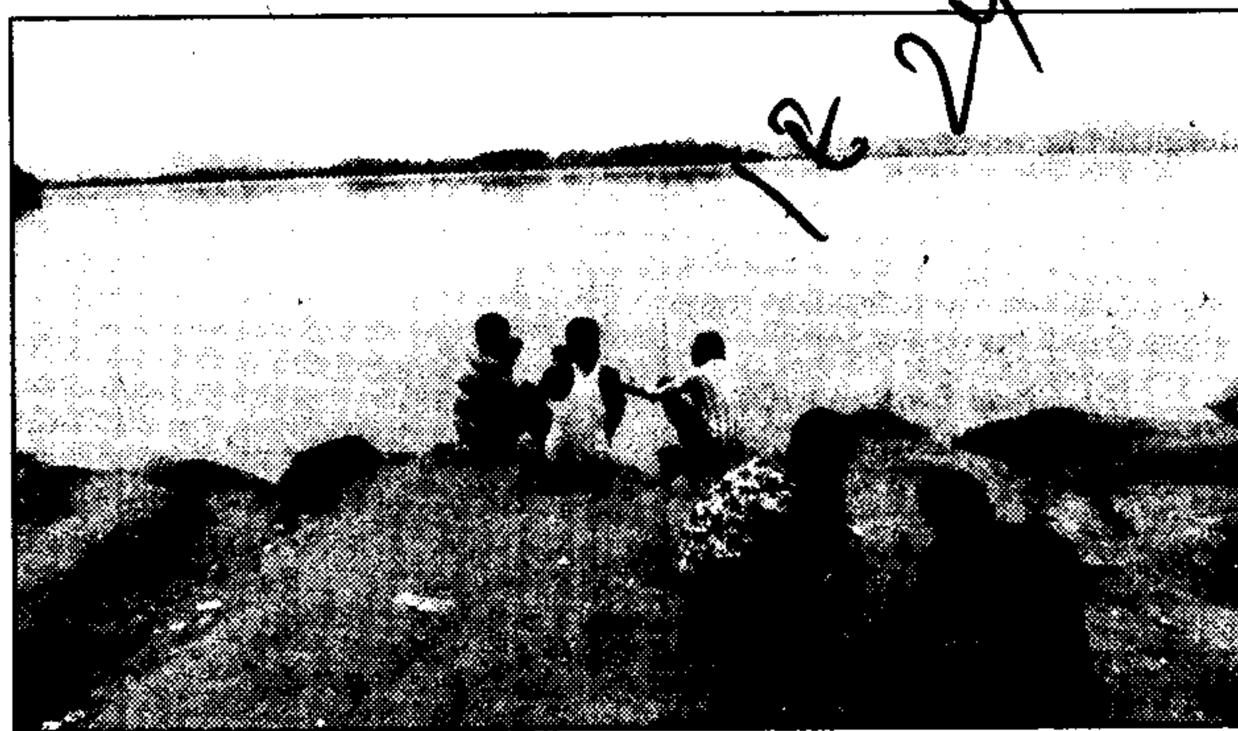
A swollen Brahmaputra Thursday.

For the 1.53 lakh people of Majuli, said to be one of the largest inhabited river islands in