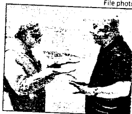
Narendra Modi with Israeli PM Benjamin Netanyahu during his visit to the country in July

Be it providing safe water supply to people across