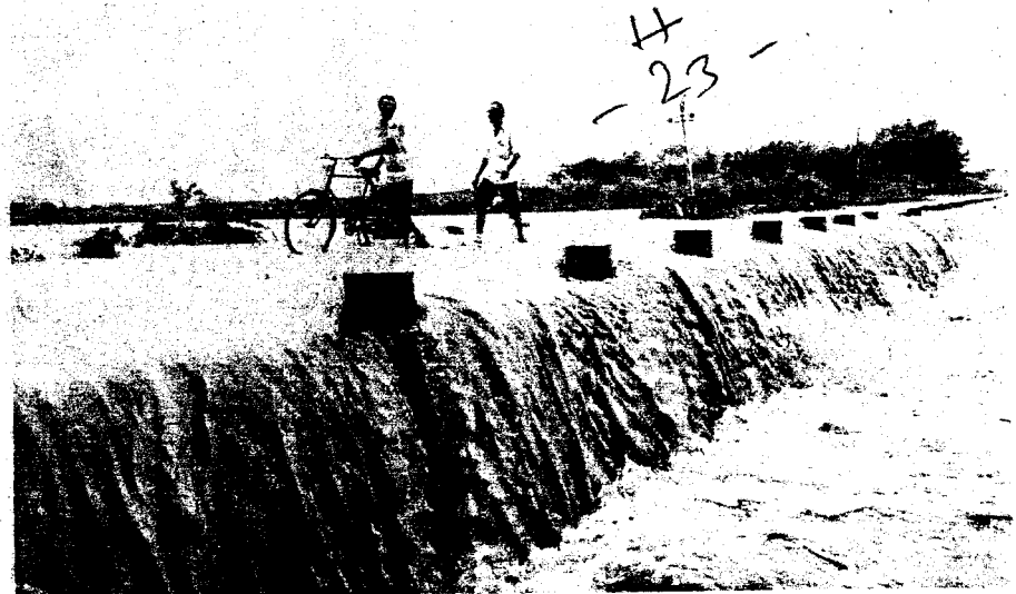
Overflowing woes: Floodwater flowing over a road at Liliya Mota in Amreli district of Gujarat on Saturday.