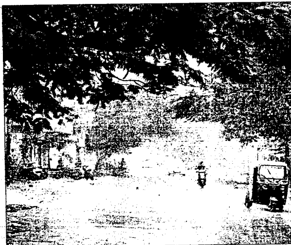
Motorists face a tough time at Sideshvara Park road in Hubballi after skies opened up on Friday.

The Tungabhadra reservoir near Hosapete received 3 tmcft, 2 tmcft on Friday alone, in