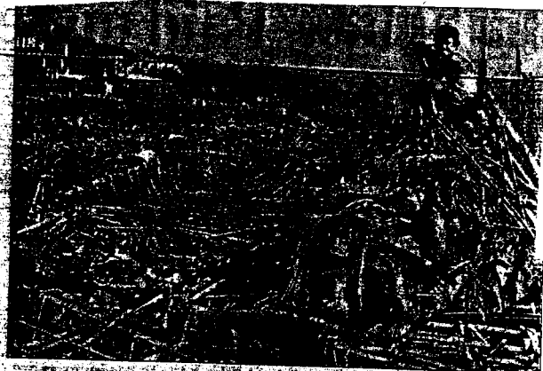
The Yamuna is getting increasingly polluted.

and documented at Bhagirath(English)& Publicity Section, CWC.