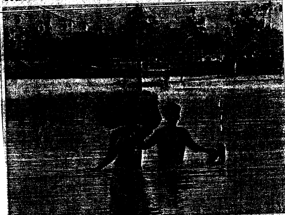
Boys wade through a flooded village on the outskirts of Agartala in Tripura on Sunday.