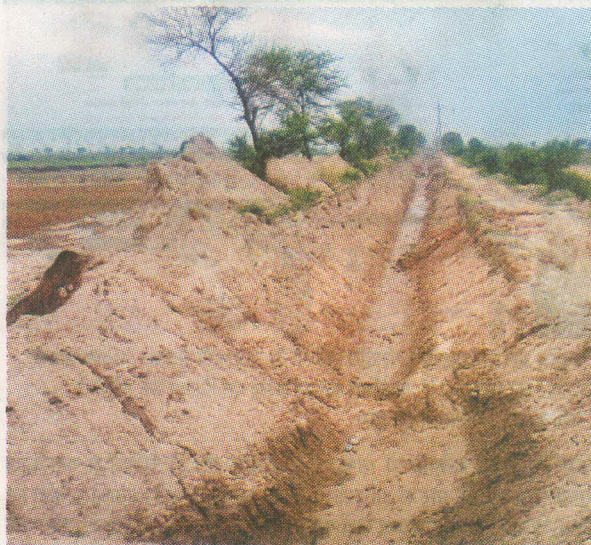
आधी-अधूरी खोदी दूबालू माइनर।

इस माइनर को नीचा कराने के लिए लोगों ने मंत्री तक हाजिरी लगाई तो कांग्रेस सरकार ने इसे सोहना रोड तक तो खोद दिया, आगे ऐसे ही छोड़ दिया। आगे पानी भेजने के लिए सोहना रोड पर पंप हाउस बनाया