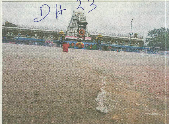
The water-logged area in front of Tirumala temple.

Normal life was affected in Tirupati city also with floodwater entering houses in low-lying