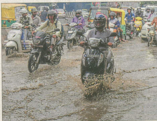
Motorists struggle on the waterlogged MG Road at Queen's Circle on Wednesday.

According to the IMD, the city received 24.9 mm of rainfall until 5.30 pm while the HAL airport received 0.8 mm rainfall. The maximum and minimum temperatures in the city were 31.9 and 22.5 degrees Celsius, respectively. The max-