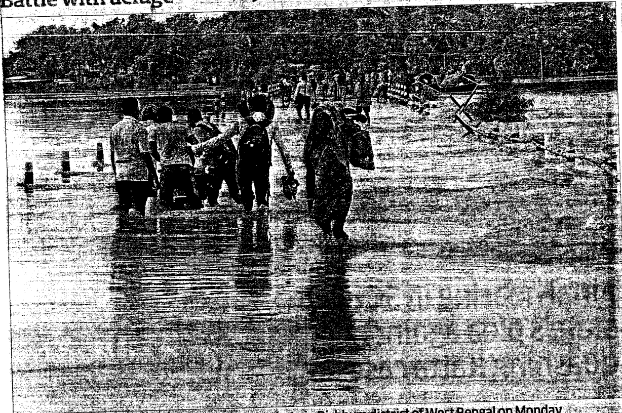
Villagers cross the flooded Kunye river at Laghata in Birbhum district of West Bengal on Monday. The river flooded after the discharge of water from the Tilpara barrage due to heavy rain.