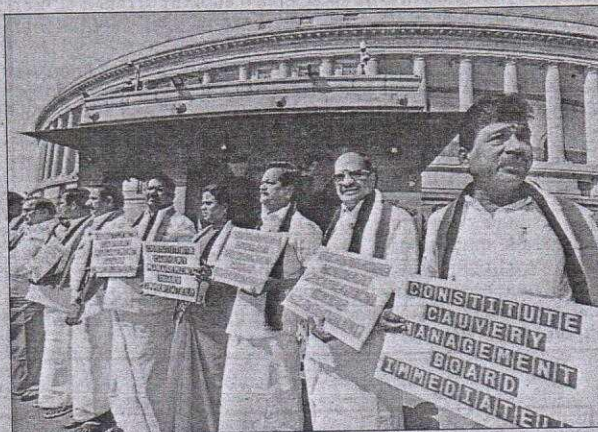
■ AIADMK leaders raise slogans in New Delhi to demand constitution of Cauvery Management Board.

The official cited above said that the authority is likely to be headed by an "independent member" ... who can be an IAS officer, a technocrat, and not necessarily a chief engineer as suggested by