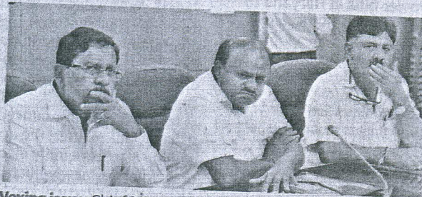
Vexing issue: Chief Minister H.D. Kumaraswamy at a meeting on the Cauvery issue. His Deputy G. Parameshwara and Minister D.K. Shivakumar are also seen.