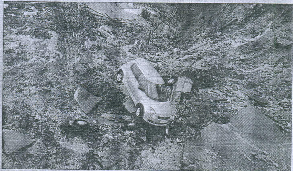
Several cars struck in debris after a wall collapsed at a construction site in Antop Hill in Mumbai on Monday.

lapses crushed cars even as strong winds made it difficult for fire brigade personnel to carry out rescue operations.