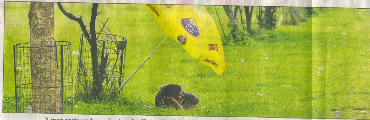
A man rests under a giant umbrella on the Maidan on Sunday afternoon.

tions spread over west Uttar Pradesh, Assam and the north west Bay have been drawing moisture from the sea. That, along with that the flow of the south-westerly monsoon