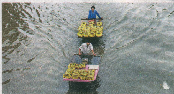
Water hurdle: Fruit vendors pass through a flooded street in Ahmedabad, Gujarat, after heavy rain on Sunday.

"South Gujarat districts like Valsad, Navasari, Surat and other parts received good rainfall. In central Gujarat, places like Dahod and Godhara also witnessed heavy showers," a Gujarat government release stated.