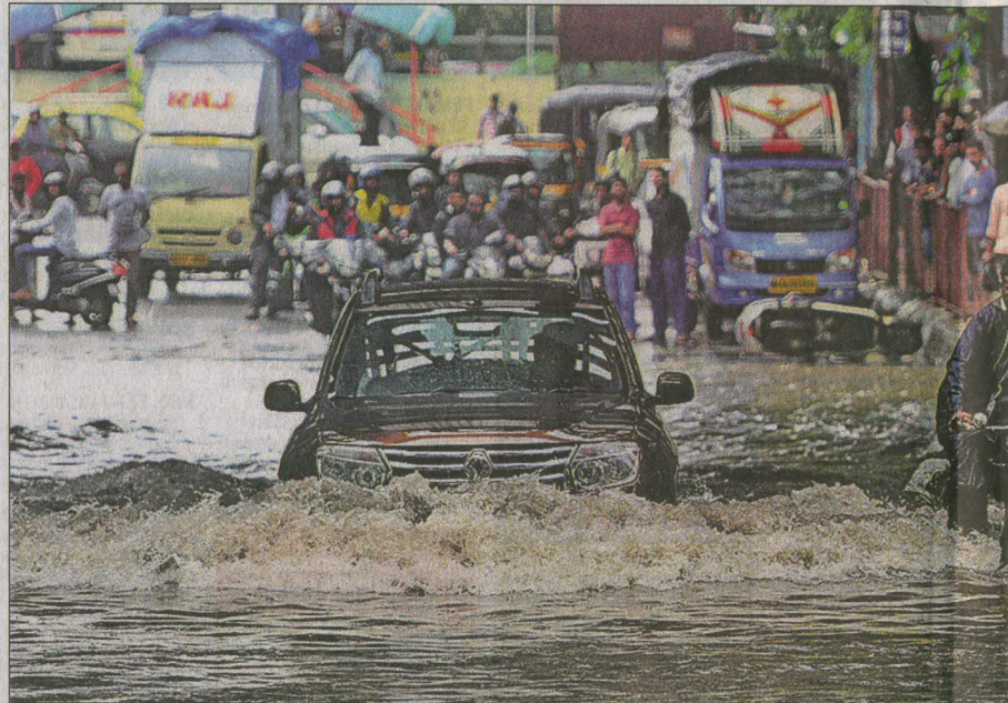
■ A car wades through a water-logged street in Mumbai on Monday.

Since June 1, the Santacruz weather station has received