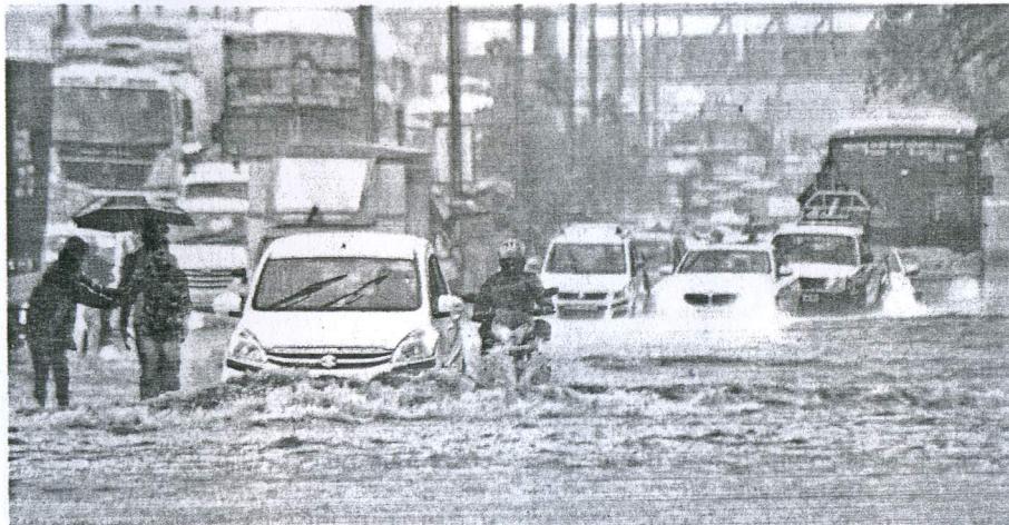
A waterlogged Pune-Mumbai Expressway near Kalamboli and, right, a woman and her child crossing the Hindmata Junction at Dadar.

Two people were killed on Sunday evening when a tree fell on them near the Metro Cinema in south Mumbai, an official from the disaster management unit of the Brihanmumbai Municipal Cor-