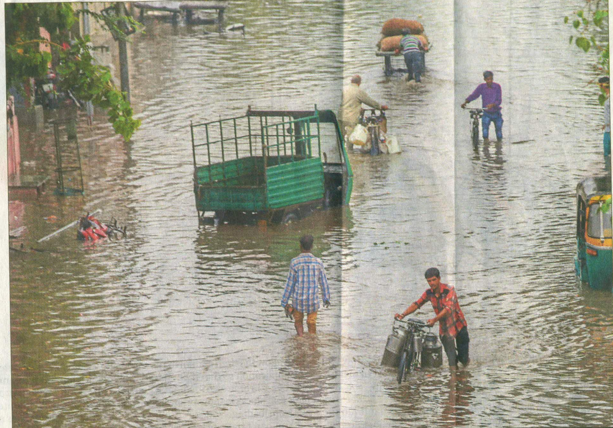
AMID HEAVY DOWNPOUR: People move through a flooded street after heavy rains, in Ahmedabad on Sunday.

"The prevailing heatwave conditions are likely to abate from northwest India from Monday. Fairly widespread rainfall with isolated heavy falls likely over south India, central and adjoining parts of northwest India," IMD said.