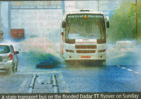
A state transport bus on the flooded Dadar TT flyover on Sunday

Extremely heavy rainfall | Greater or equal to 204.5mm