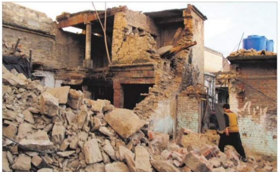
A man walks past the rubble of a house damaged in the quake in Swat, Pakistan, on Monday; and (right) an injured schoolgirl.

At least 12 schoolgirls were trampled to death in a northern Afghan province. "The students rushed out of the school building in Takuqan city (capital of Takhar), triggering a stampede," Takhar education department chief Enayat Naweed said.