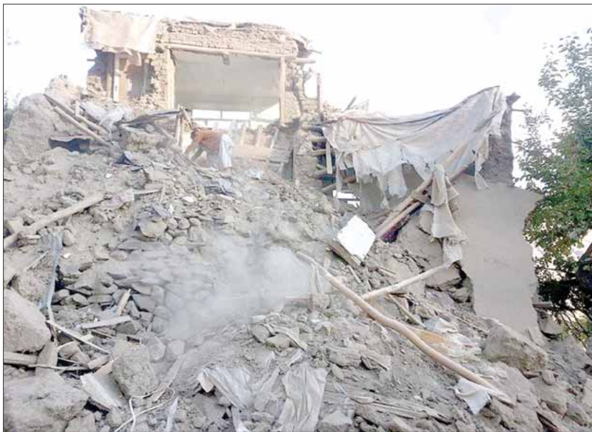
सोमवार की दोपहर आए भीषण भूकम्प से अफगानिस्तान के रमनखील इलाके में सैकड़ों घर पलभर में जमींदोज हो गए।