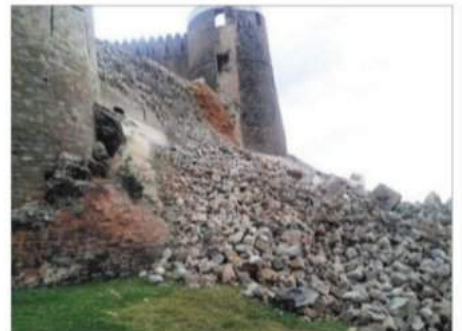
Reasi's Bhimgarh Fort was damaged in the earthquake.

The intensity of today's earthquake was reminiscent of the devastating earthquake of October 2005 that claimed thousands of lives. At the Srinagar's civil secretariat, which houses the headquarters of the state government and offices of ministers, security personnel got the sprawling complex vacated