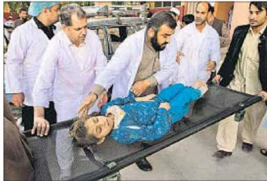
(Above) Residents walk past the rubble of a house after it was damaged by the earthquake in Mingora, Swat, Pakistan. Rescue workers move a girl at a hospital, who was injured in Jalalabad, Afghanistan.