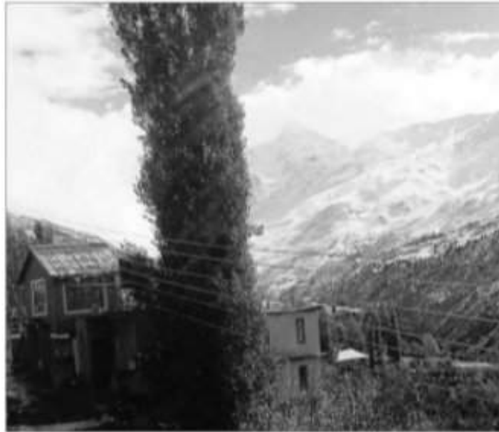
Manali hills after fresh snowfall on Monday.