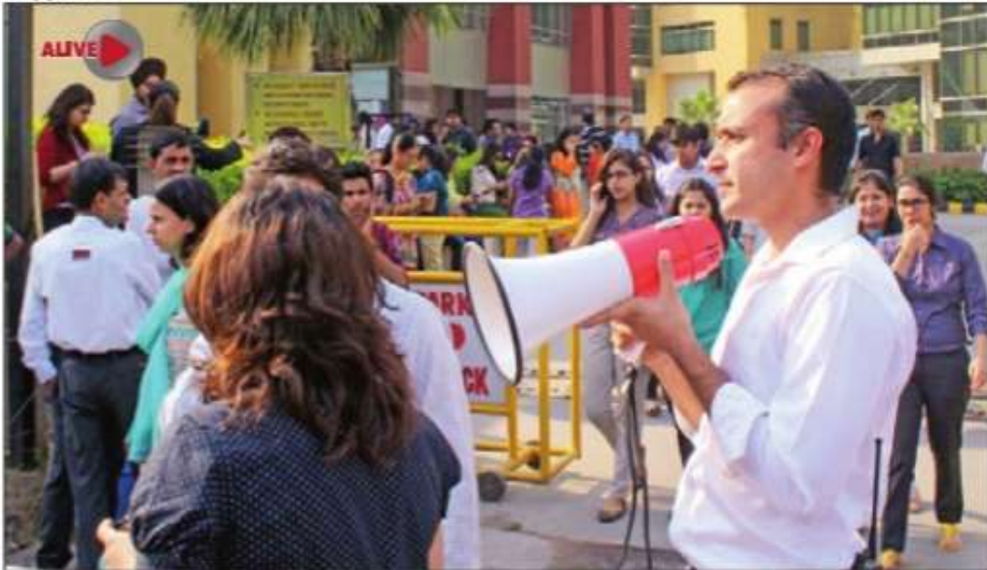
OVERWHELMED BY NATURE: This was a common sight at many residential societies across NCR