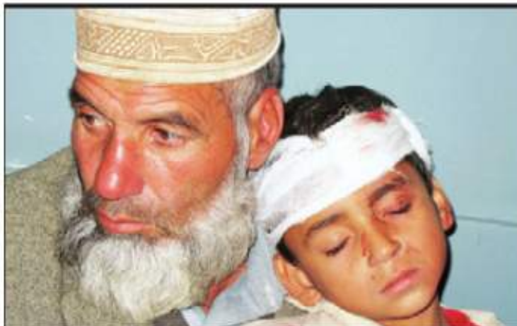
A boy who was injured during the earthquake leans on his father's shoulder after receiving first aid in Mingora, Pakistan