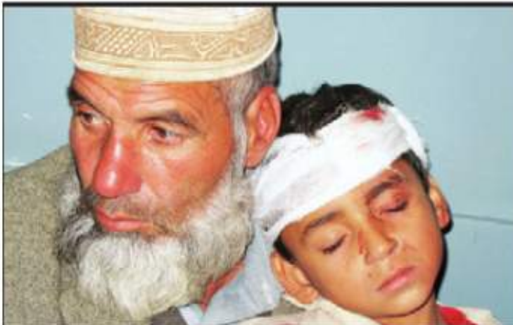
A boy who was injured during the earthquake leans on his father's shoulder after receiving first aid in Mingora, Pakistan