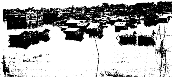
A view of submerged houses in Darbhanga district.

had receded at some places, prompting many to return home, officials said.