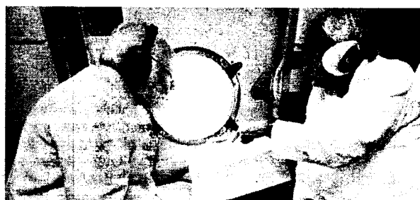
PM Narendra Modi and CM Nitish Kumar conduct an aerial survey of flood-hit Bihar on Saturday.

Reports said that everyone was expecting a bigger package from the PM who had failed to keep his promise of granting Rs. 1.25 lakh crore special package to Bihar as announced during the Assembly poll campaign. Moreover, the BJP which was given the mandate to sit in the Opposi-