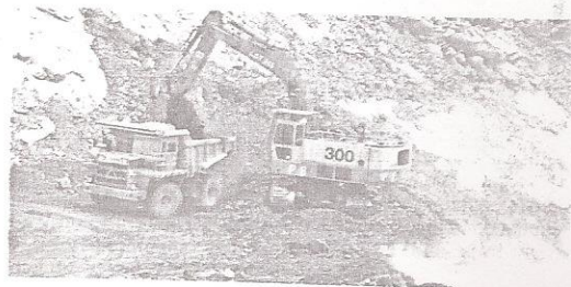
LEASE OF LIFE: FICCI has written to the Mines Ministry seeking extension of deadlines set on these mines. — FILE PHOTO

"I would like to bring to your attention the issue of two immediate deadlines for mining leases where it is not practically possible to obtain requisite clearances under the Forest (Conservation) Act of 1980 and the Scheduled Tribes and Other Traditional Forest Dwellers (Recognition of Forest Rights) Act of 2006," FICCI secretary general A. Didar Singh