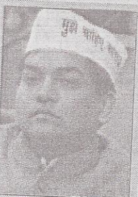
जलमंत्री कपिल मिश्रा

लेकर हामी भर दी है। उम्मीद है जल्द ही दिल्ली सरकार को केंद्र से यमुना सफाई के लिए मनचाही रकम मिल जाए। दिल्ली सरकार ने केंद्र सरकार से यमुना सफाई के लिए 6 हजार