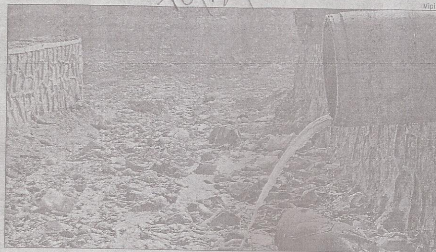
DIRTY PICTURE: HC had directed the civic body to build a dhalao at a distance from the water body

HC had directed the civic body to construct a new dhalao at a distance from the water body and Delhi government was asked to give land for it eight months ago. "We