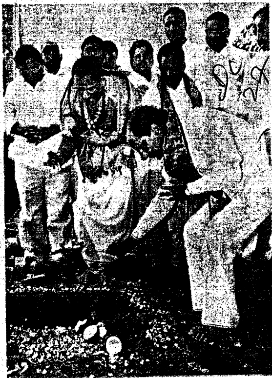
A file photo of Chief Minister K. Chandrasekhar Rao laying the foundation stone for the Bhakta Ramadasu Lift Irrigation scheme project at Palair in Khammam district on February 16, 2016.

The scheme would irrigate 60,000 acres in hitherto parched lands in Tirumalayapalem, Kusumanchi, Nelakondapally, Mudigonda, Khammam Rural mandals under