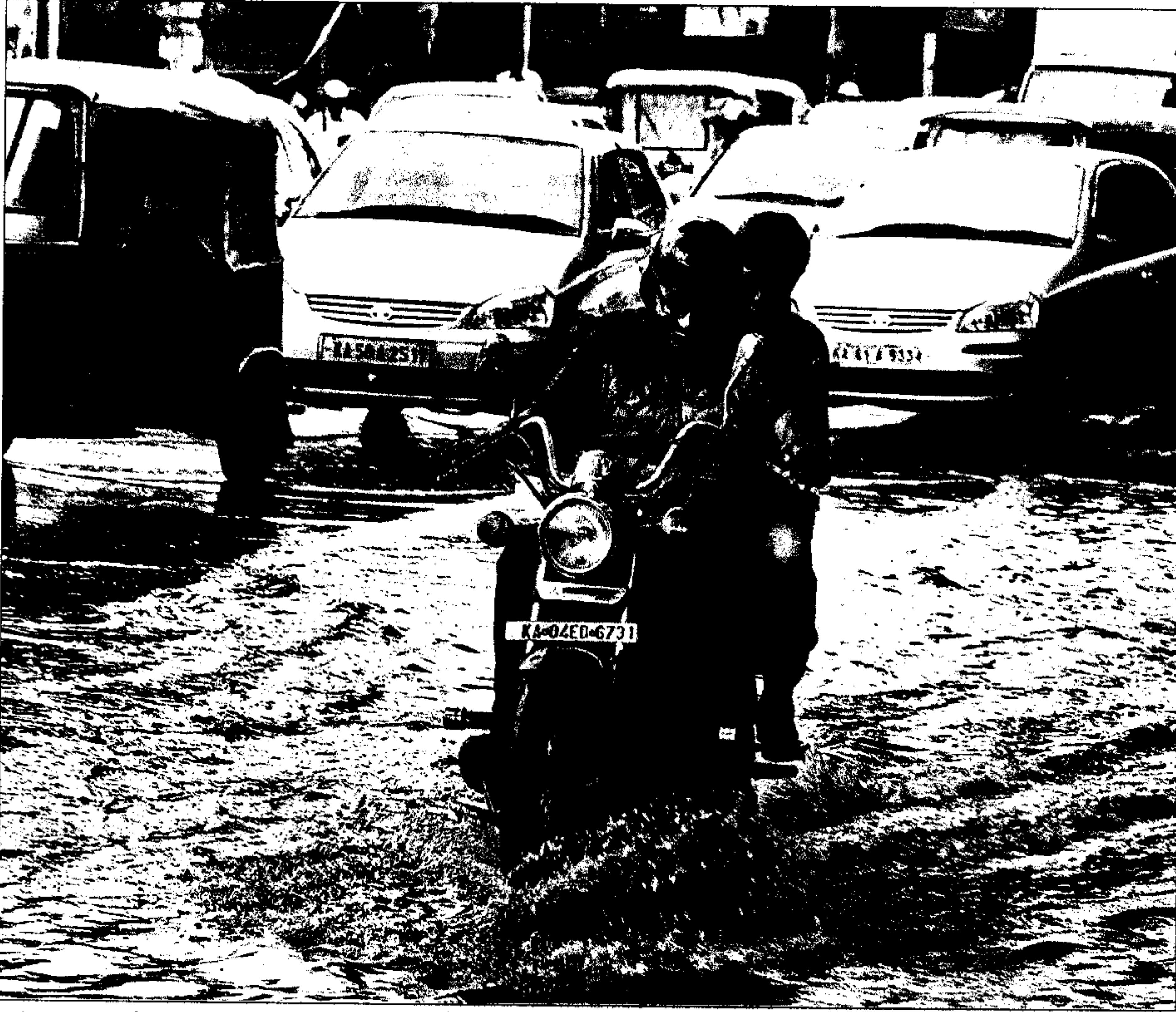
A motorist struggles at the flooded Chalukya Circle junction following heavy rain, in Bengaluru on Monday.