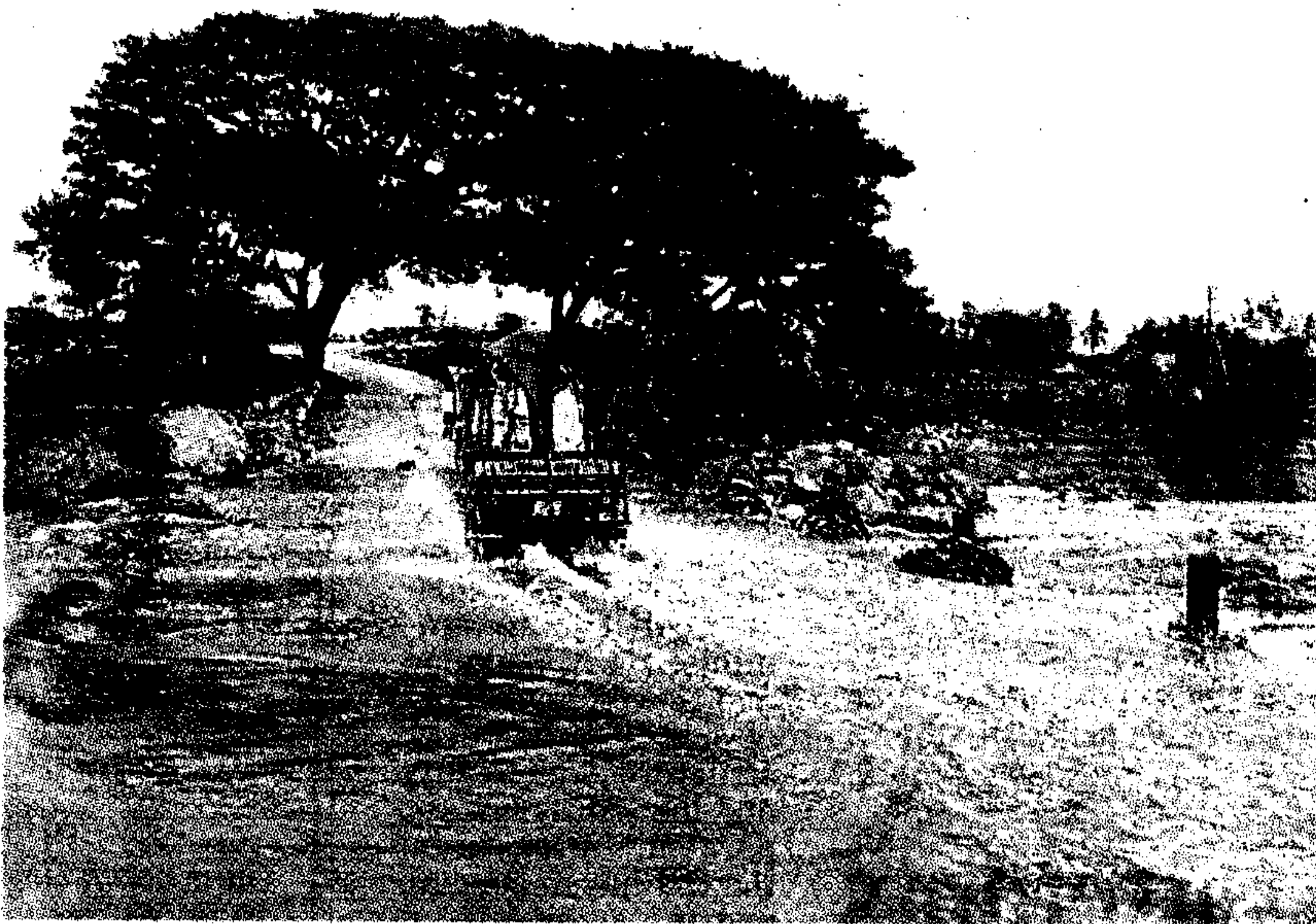
Water from the flooded Musi affected the movement of traffic near its banks in the city on Tuesday