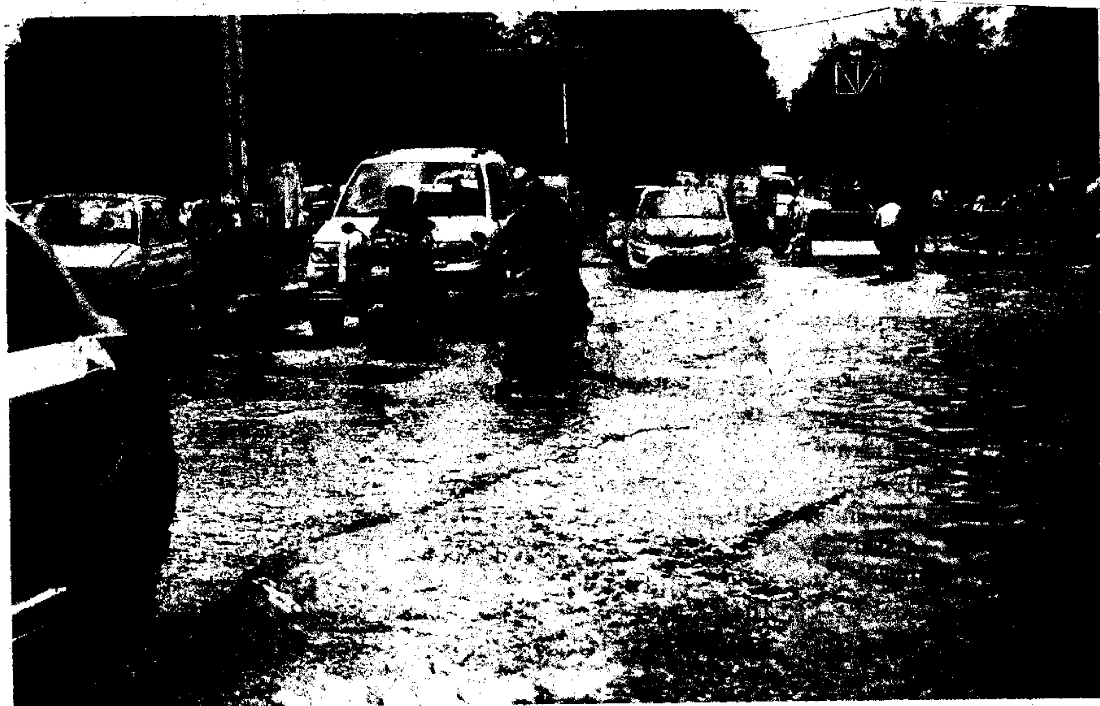
TRAFFIC WOES: Vehicles moving through water-logged street after heavy rain in Bhopal on Wednesday.

and documented at Bhagirath(English)& Publicity Section, CWC.