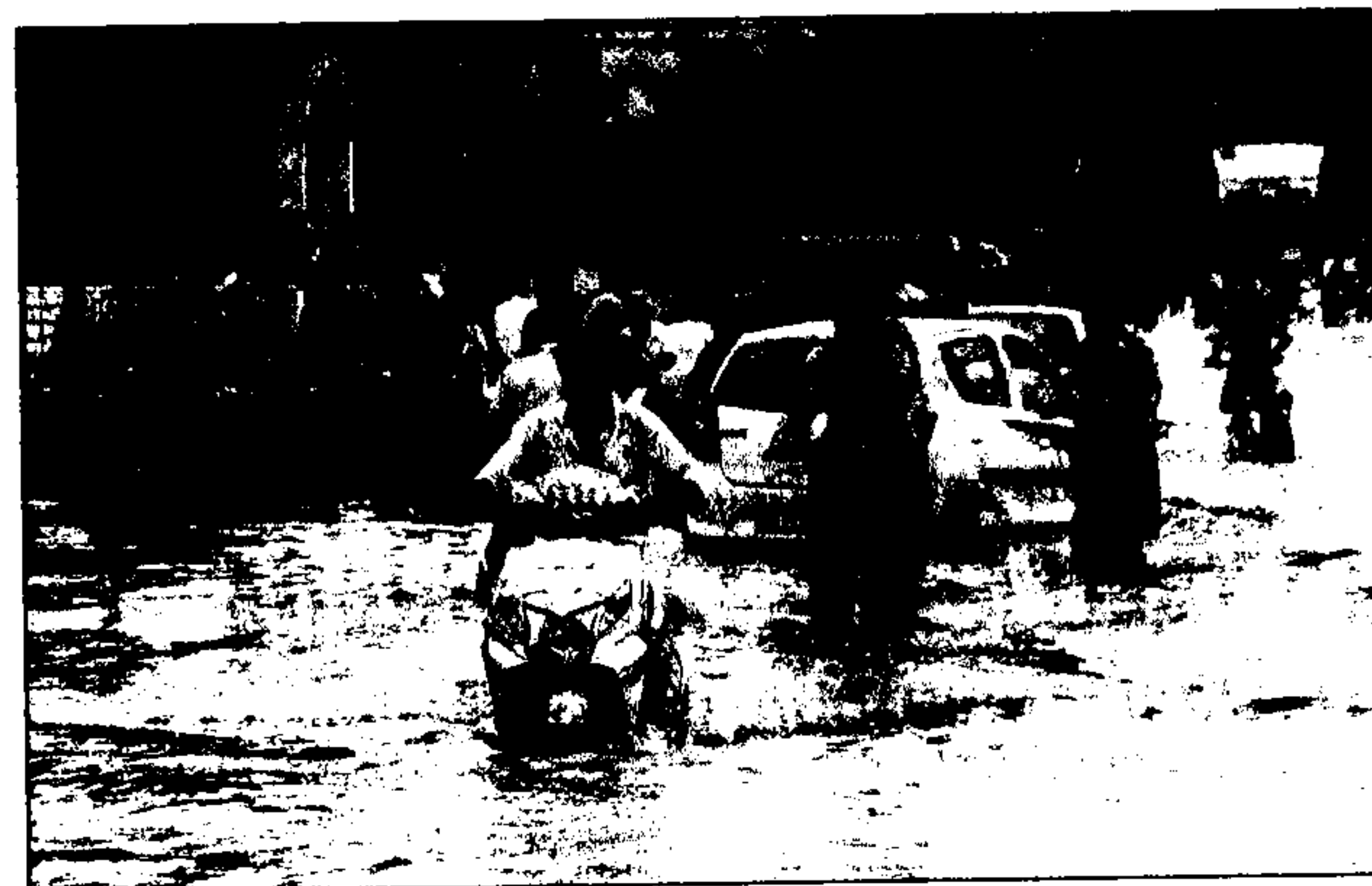
(Above) Coconut trees washed away due to sea erosion at Ullal in Dakshina Kannada district. (Left) Children struggle on a waterlogged road in Hosapete, in Ballari district.

district. However, Karwar received uninterrupted rains for more than two hours. In the last 24 hours, the district recorded 589 mm of rains.