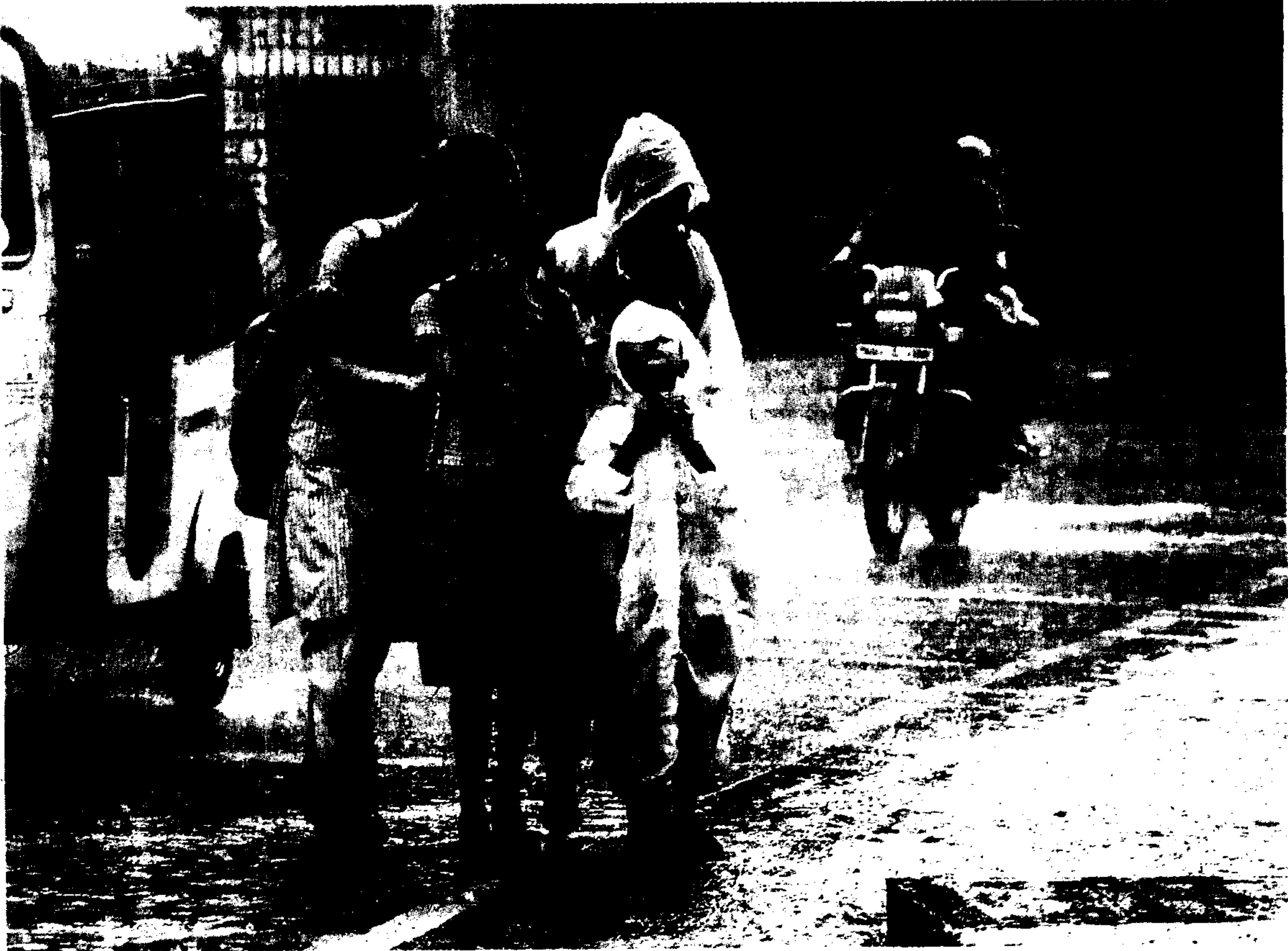
UNTIMELY SHOWERS: Schoolchildren caught in the sudden rain near Anna Salai on Tuesday. The unseasonal rain meant only some had raincoats or umbrellas with them.