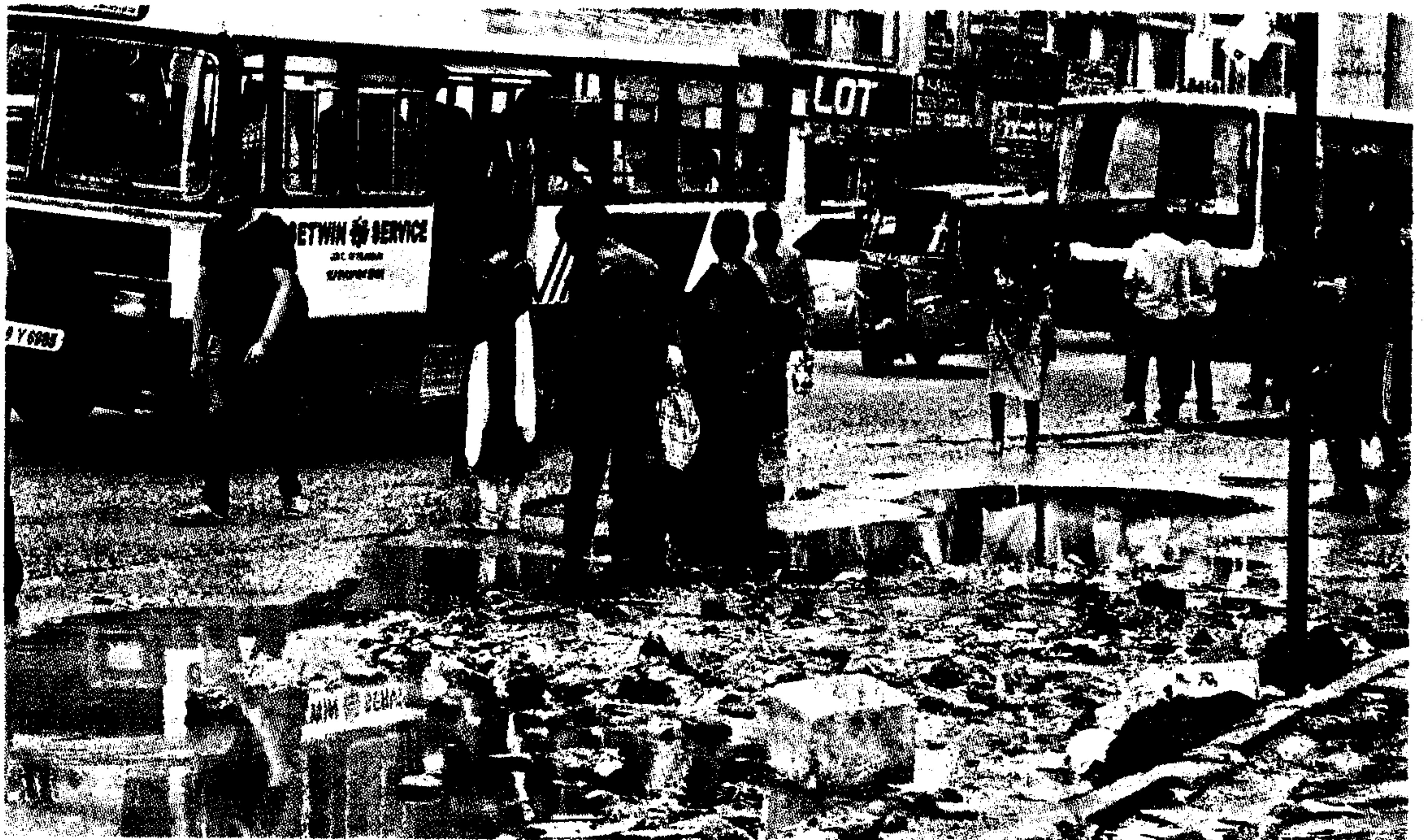
Commuters avoid potholes filled with water as they wait for buses in the city. Two days of heavy rain have brought the city to a standstill as widespread chaos was reported from several area

The roads dug up by various agencies like Hyderabad Metropolitan Water Supply and Sewerage Board and APTransco at Minister's Road, Srinagar Colony and other places in the city only added to the woes of motorists.