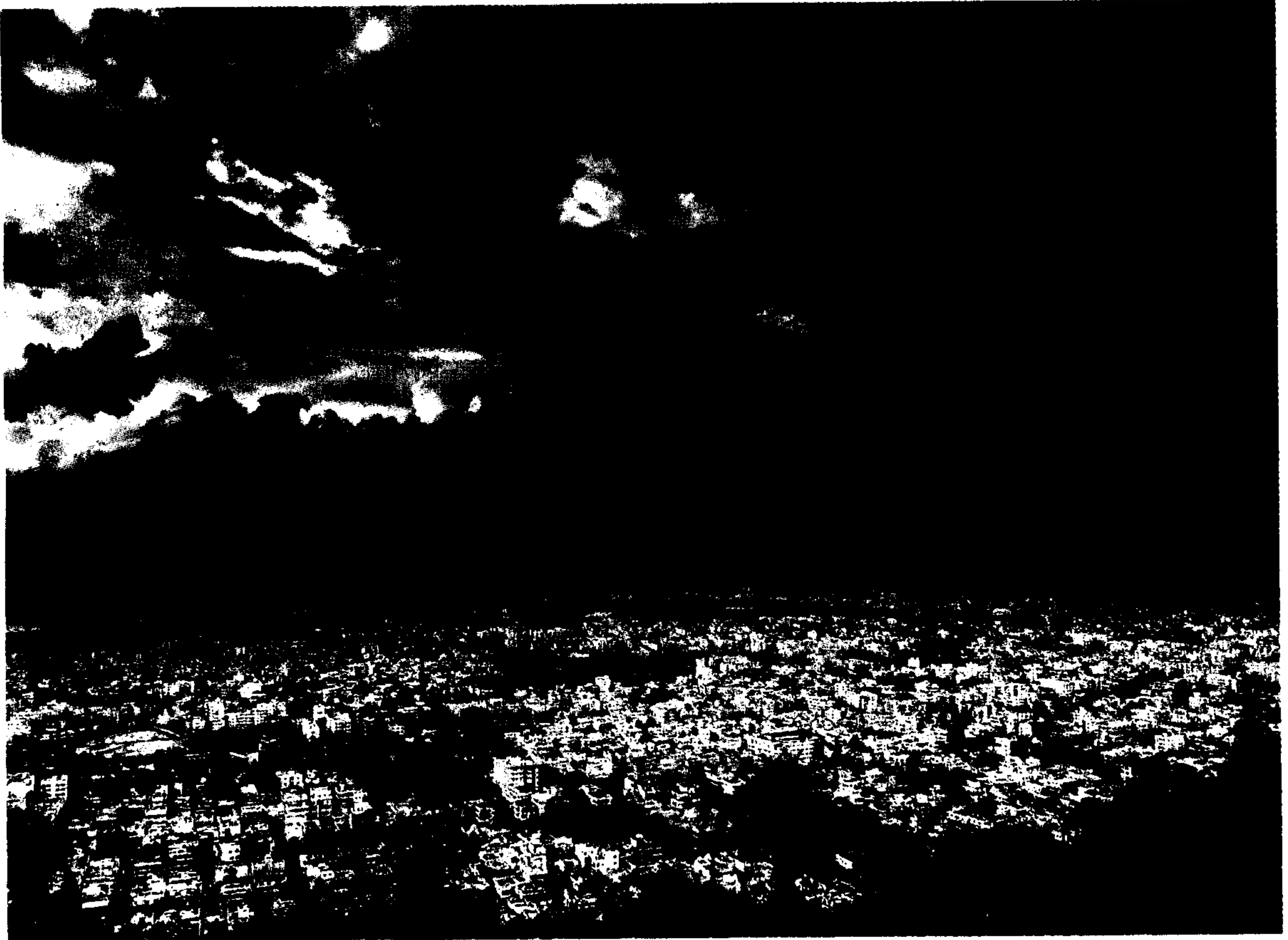
DARK AND DEEP: Thick clouds hover over Visakhapatnam on Tuesday under the influence of a low pressure area in the Bay of Bengal. The south-west monsoon has been active over coastal Andhra Pradesh.