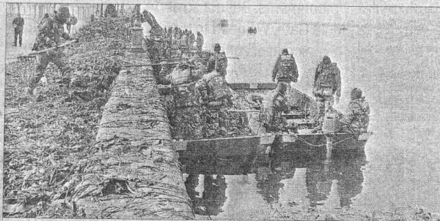
Soldiers remove lilies and weeds from the Dal Lake in Srinagar on Tuesday.

The soldiers start the exercise of removing lily patches from the lake early morning when the temperatures are still sub-zero. The uprooted lilies are collected in boats and dumped on the banks.