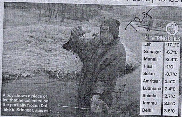
(CW) conditions are likely over core CW zone of the country," it also said.

A December-3 statement by the India Meteorological Department (IMD) had forecast "above normal subdivision averaged seasonal minimum temperatures" during the cold weather season (December 2018 to February 2019) over all meteorological subdivisions of the country. "Below normal Cold Wave