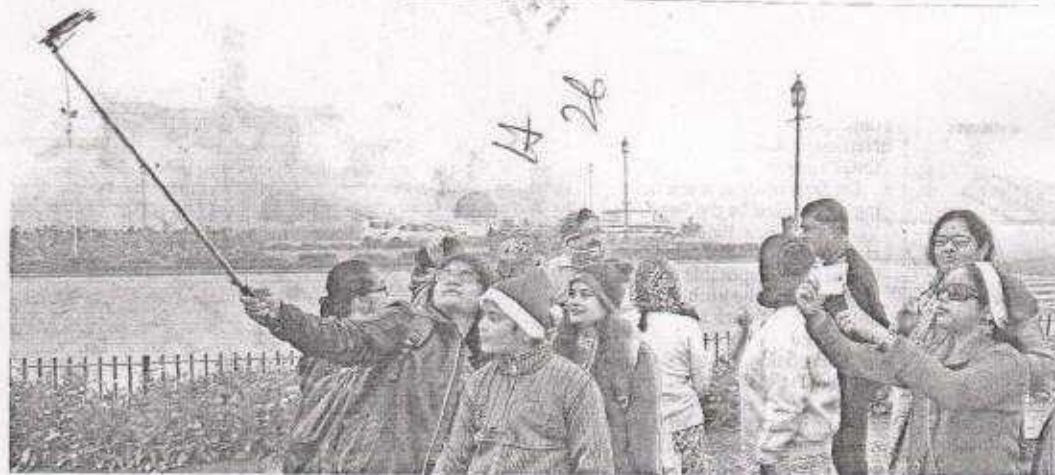
CHRISTMAS SELFIE: People enjoy the foggy weather at Rajpath on Sunday.

The maximum temperature fell by almost 10 degrees during the day, as the city received no sunlight to warm the air or the surface due to the shallow fog, he added.