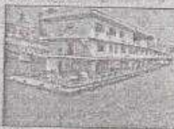
A ferry terminal in China

Inland Waterways Authority of India (IWA), which has been tasked with developing the stretch between Varanasi and Haldia in West Bengal, has signed an agreement with a joint venture of MIT and Thompson Design Group of the US. This stretch, named National Waterway-1, is being developed for navigation of both passengers and cargo.