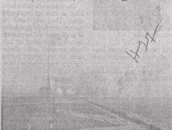
WHITE COVER: Jaipur witnessed heavy fog on Monday morning.

JAIPUR: Night temperatures dipped in parts of Rajasthan with Mount Abu, the sole hill station of the desert State, shivered at 2.4 degrees Celsius.