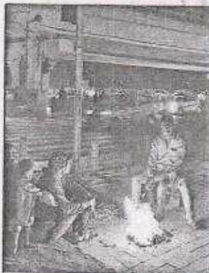
नई दिल्ली में सोमवार तड़के सड़क किनारे आम तापते लोग।