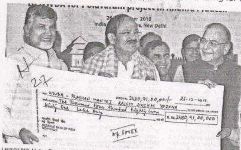
LAUNCH PAD: Union Finance Minister Arun Jaitley handing over a cheque for the Polavaram project to A.P. Chief Minister N. Chandrababu Naidu in New Delhi on Monday. Minister for Urban Development, Venkaiah Naidu, is also seen.

He was speaking at an event attended by Andhra Pradesh Chief Minister