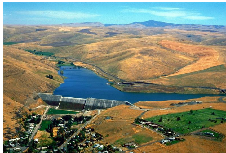
Integrated River Basin Management

Organized by NATIONAL WATER ACADEMY PUNE