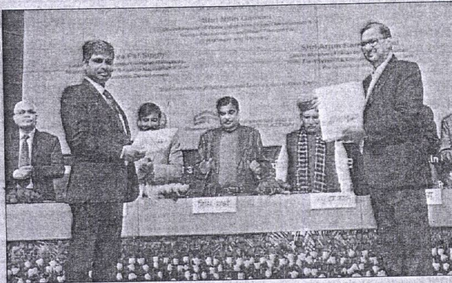
कानपुर में शुक्रवार को 'वन सिटी-वन ऑपरेटर' योजना कार्यक्रम में शिरकत करते केंद्रीय जल संसाधन, नदी विकास और गंगा संरक्षण मंत्री नितिन गडकरी।

गडकरी ने उत्तर प्रदेश के कानपुर में गंगा में गिरने वाली गंदगी को रोकने के लिए 'वन सिटी-वन ऑपरेटर' योजना के तहत शुक्रवार को यहां हुए एक समझौते के मौके पर पत्रकारों को संबोधित करते हुए कहा कि गंगा की सफाई से जुड़ी सभी परियोजनाओं के लिए दिसंबर तक निविदाएं आमंत्रित कर ली जाएंगी और दावा किया कि मार्च तक गंगा 70 से 80 फीसदी तक निर्मल हो जाएगी। उन्होंने कहा कि गंगा का